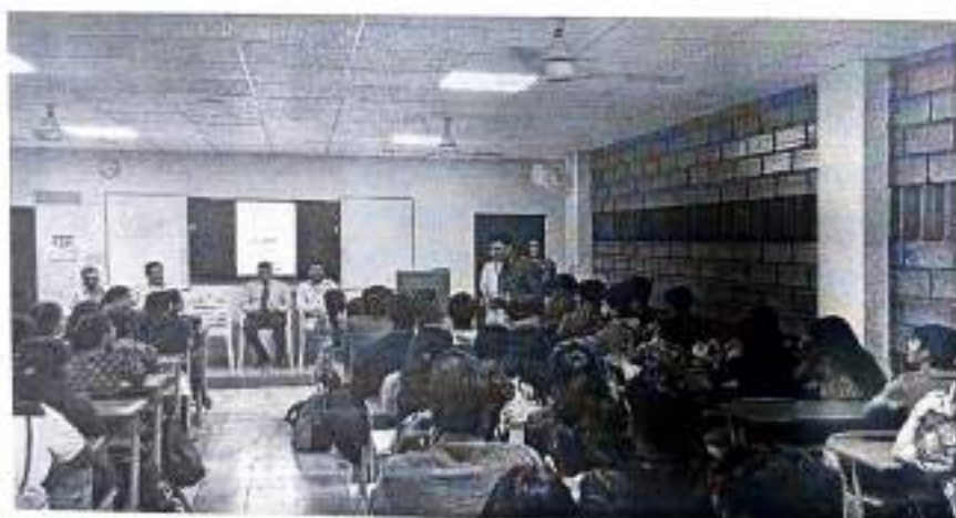
Photo 2. The principal addressing the students