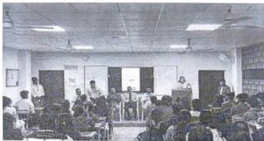
Photo 1. Welcoming of the Guests.