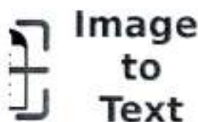
Image to Text