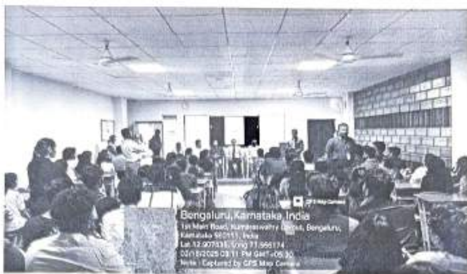
Photo 3. Student participants