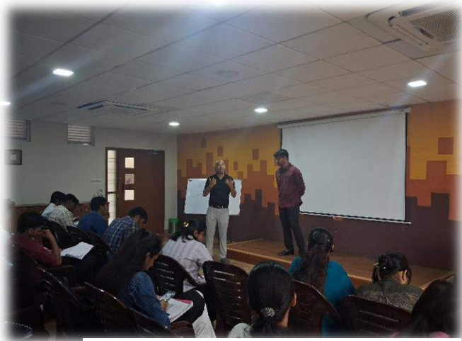
Soft Skill Trainer Engaging the Session