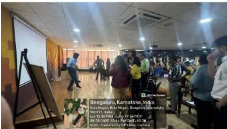
Students being involved in Activity