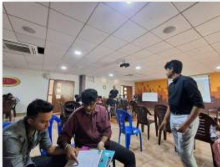
Students being involved in Activity