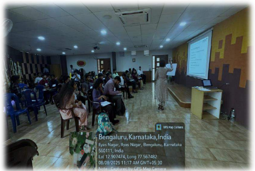
Soft Skill Trainer Engaging the Session