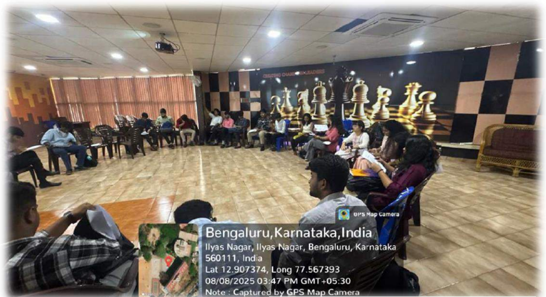
Soft Skill Trainer Engaging the Session