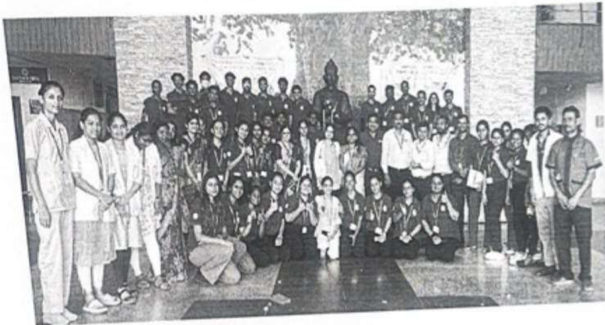
Pic 7: Group Photo