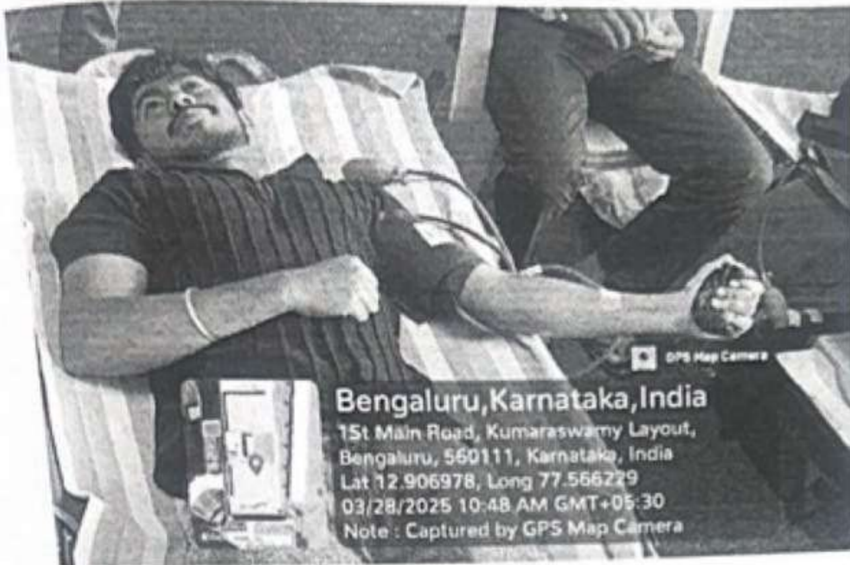
Pic 6: Blood donation from donors