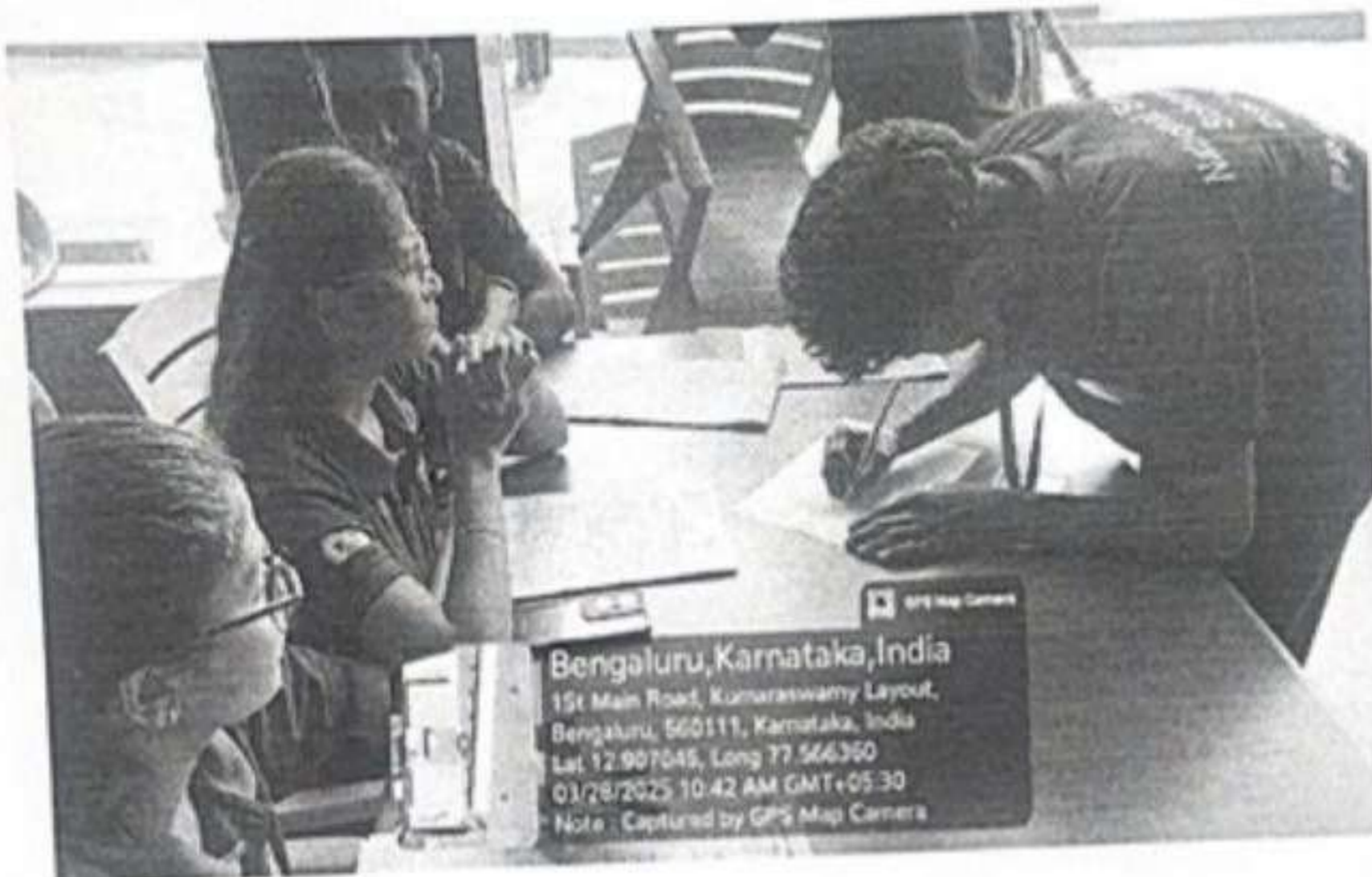
Pic 4: Registration for Blood donation