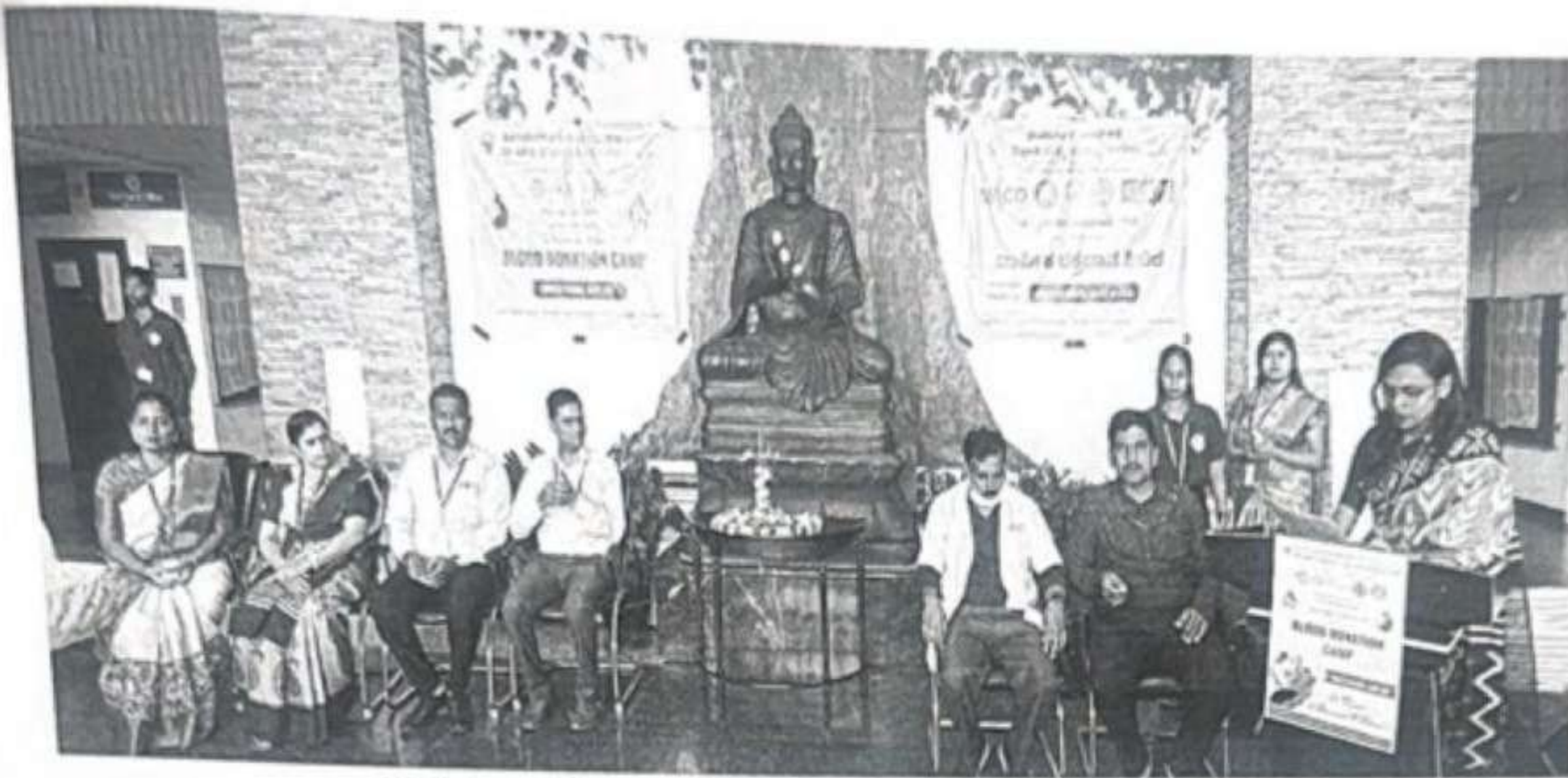
Pic 1: Formal inaugural ceremony of Blood Donation Camp