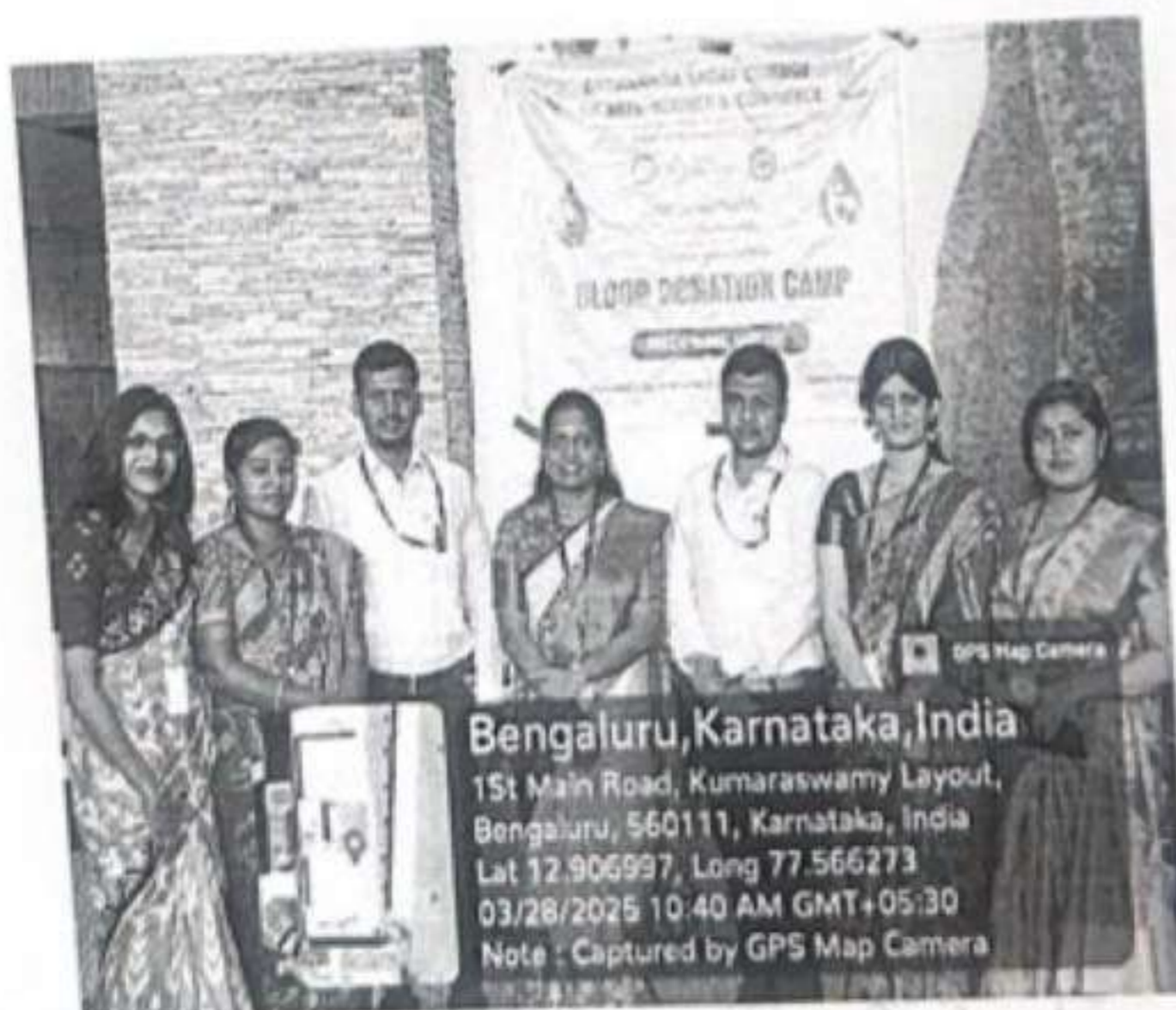
Pic 8: ISR Committee