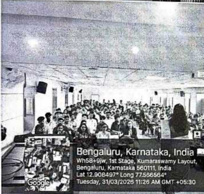
Bengaluru, Karnataka, India Wh5B+9jw, 1st Stage, Kumaraswamy Layout, Bengaluru, Karnataka 560111, India Lat 12.908497° Long 77.566564° Tuesday, 31/03/2026 11:26 AM GMT +05:30