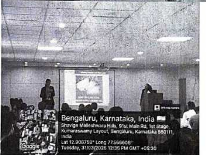
Bengaluru, Karnataka, India Shavige Malleshwara Hills, 91st Main Rd, 1st Stage, Kumaraswamy Layout, Bengaluru, Karnataka 560111, India Lat 12.908758° Long 77.566606° Tuesday, 31/03/2026 12:35 PM GMT +05:30