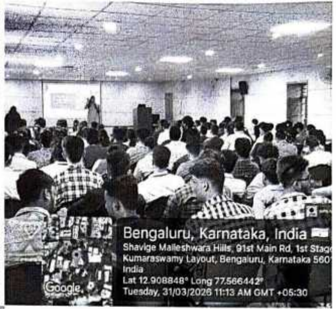
Bengaluru, Karnataka, India Shavige Malleshwara Hills, 91st Main Rd, 1st Stage, Kumaraswamy Layout, Bengaluru, Karnataka 560111, India Lat 12.908848° Long 77.566442° Tuesday, 31/03/2026 11:13 AM GMT +05:30