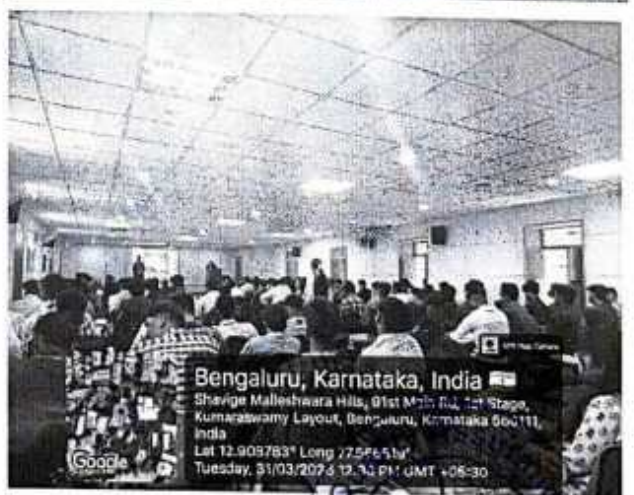
Bengaluru, Karnataka, India Shavige Malleshwara Hills, 91st Main Rd, 1st Stage, Kumaraswamy Layout, Bengaluru, Karnataka 560111, India Lat 12.908783° Long 77.566514° Tuesday, 31/03/2026 12:33 PM GMT +05:30