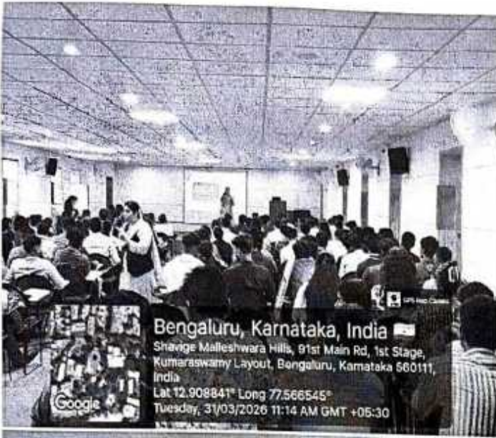
Bengaluru, Karnataka, India Shavige Malleshwara Hills, 91st Main Rd, 1st Stage, Kumaraswamy Layout, Bengaluru, Karnataka 560111, India Lat 12.908841° Long 77.566545° Tuesday, 31/03/2026 11:14 AM GMT +05:30