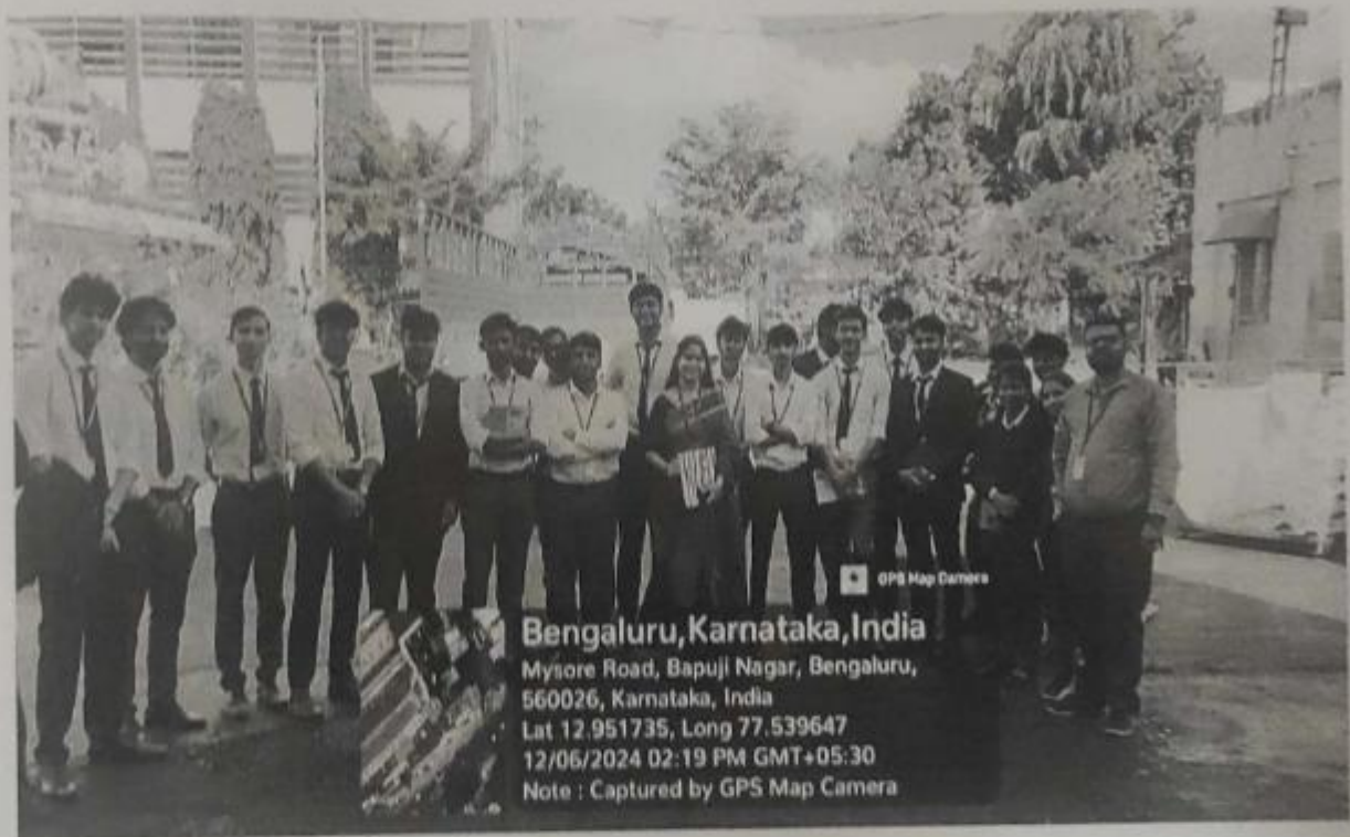
Gallery III: Showing the KAVIKA representatives, staff & students