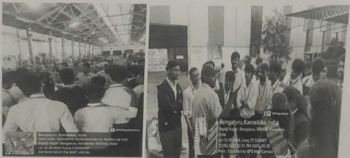
Gallery II: Showing the KAVIKA representatives sharing the details of the plant layout