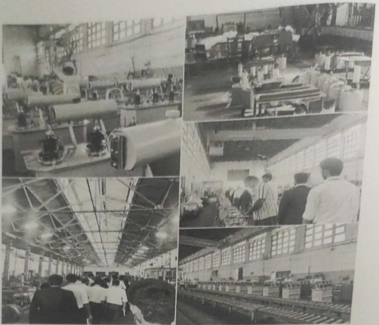
Gallery I: Showing the internal production operations of KAVIKA