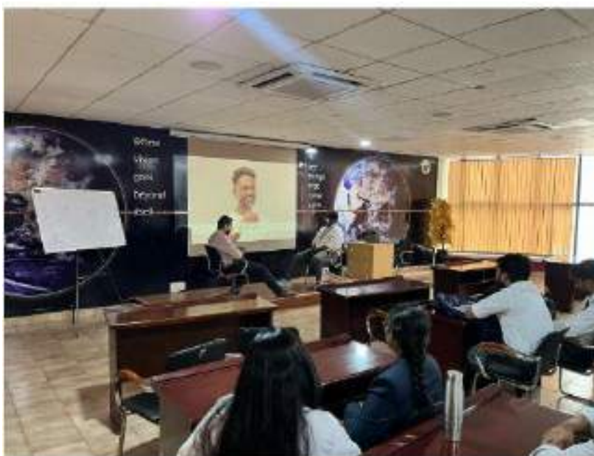
Photo 2 - One-to-one interview in CIL