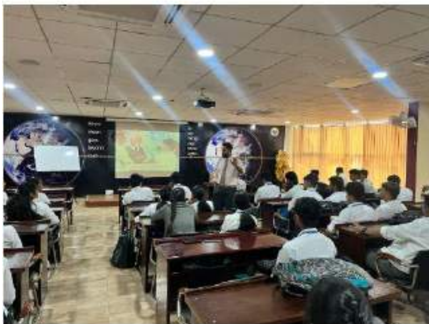
Photo 1 - Trainer started the session