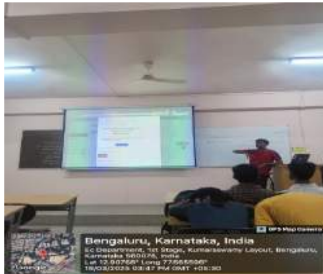
Fig 3: Hitesh delivering the note