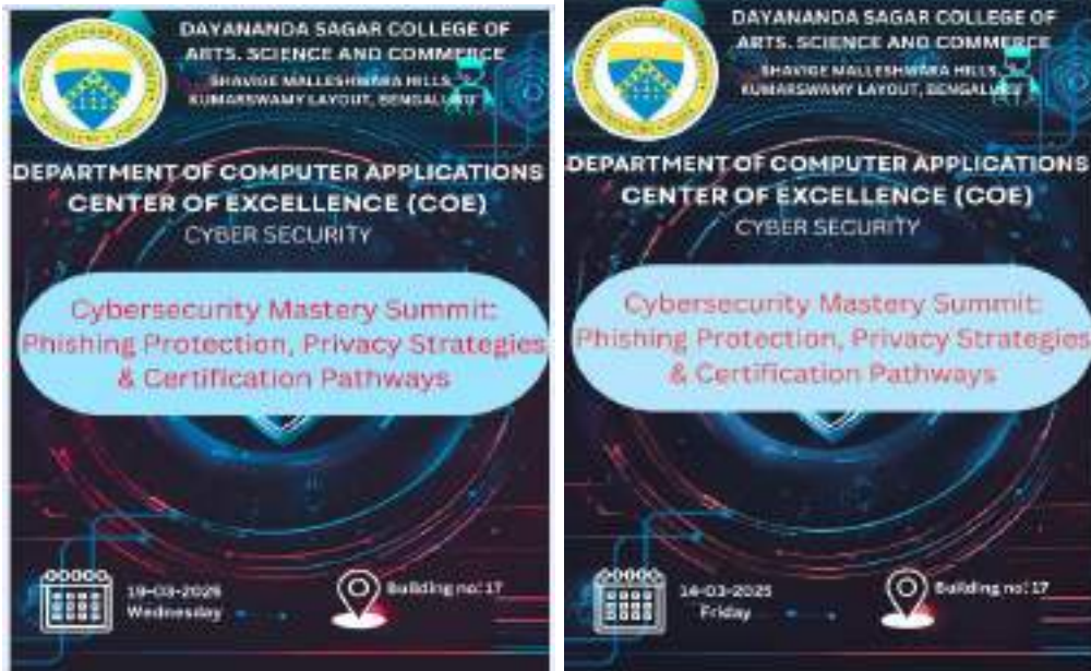
Fig 1: Boucher of Data Privacy, Best Practices using Secure Browser & Phishing Awareness

Data Privacy, Best Practices using Secure Browser & Phishing Awareness