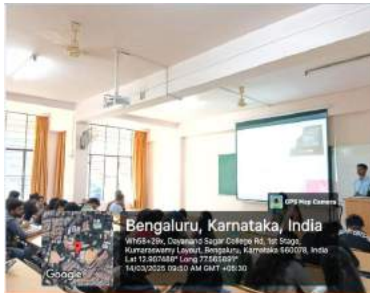
Fig 2: Hitesh delivering the note