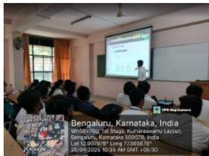
Fig5: Students Actively participating