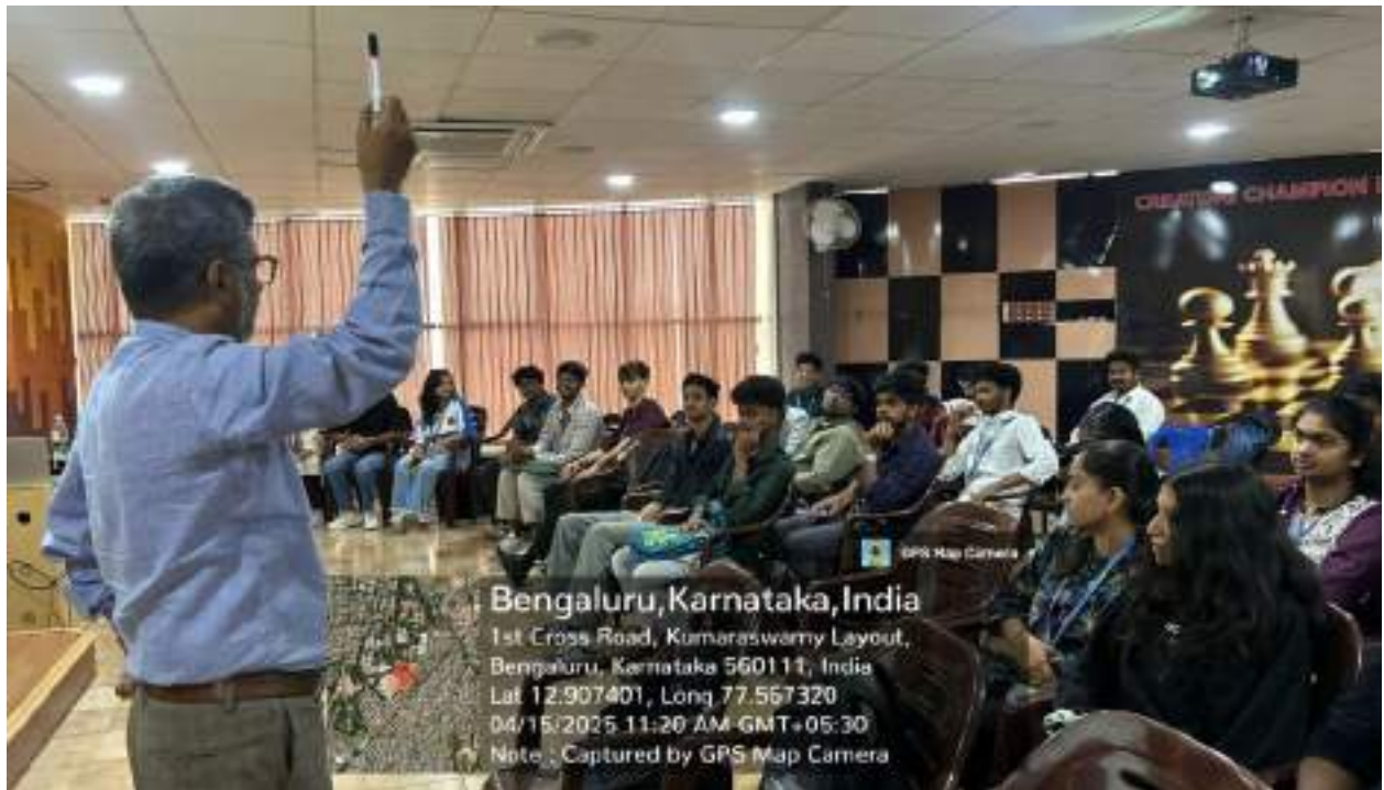
Photo 3- Students Participation