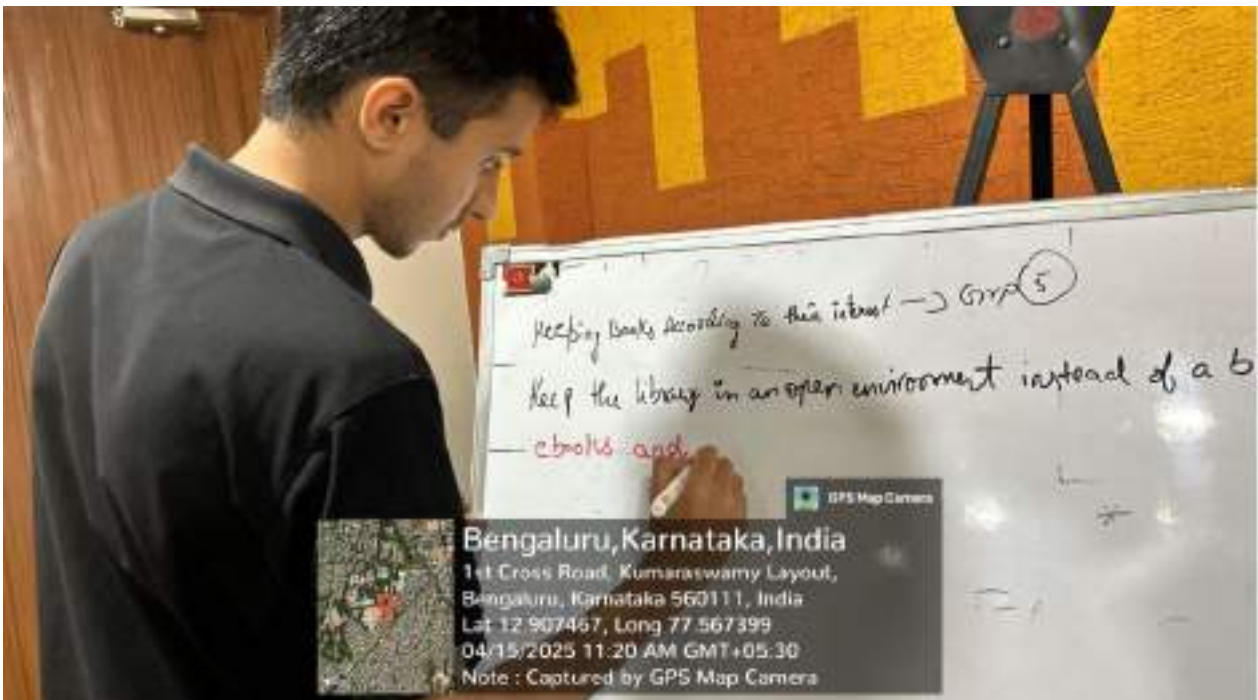
Photo 4- Activity Given to individual Participants