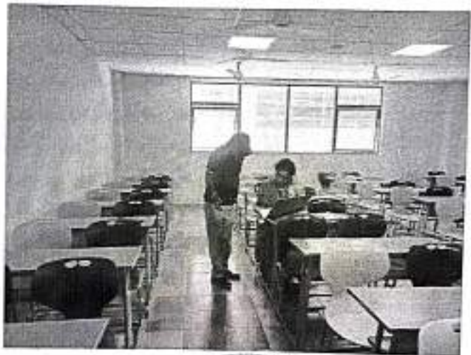
Pic:4 Teachers explaining about addon course