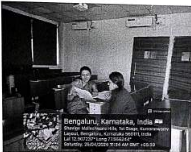
Pic:3 Teachers explaining about extra curricular