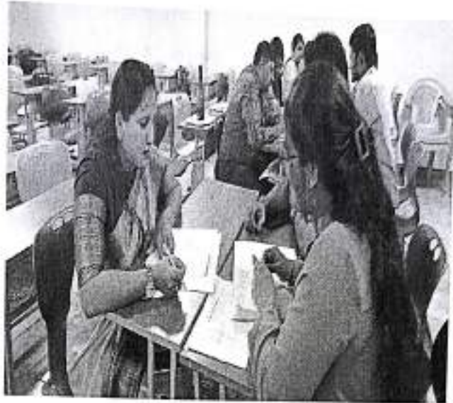
Pic:2 Teachers explaining about attendance status