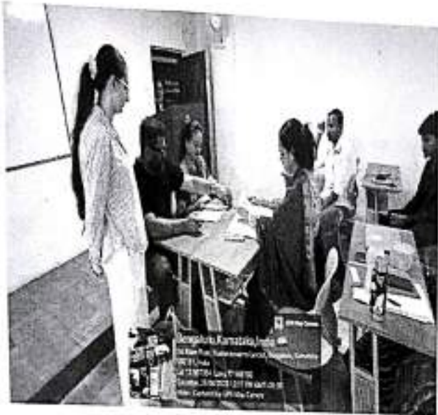
Pic:1 Teachers informing about internal marks