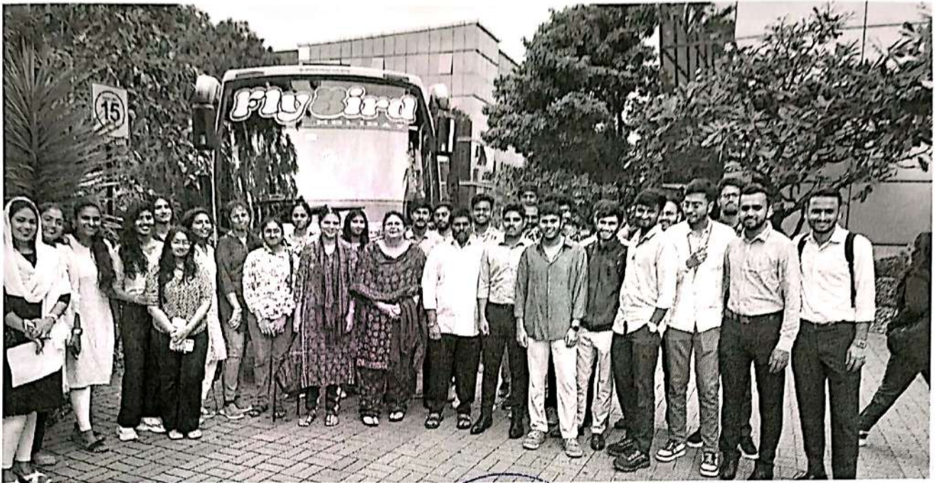
Figure 1 – Students gathered near Heritage Building just before commencing the Industrial Visit