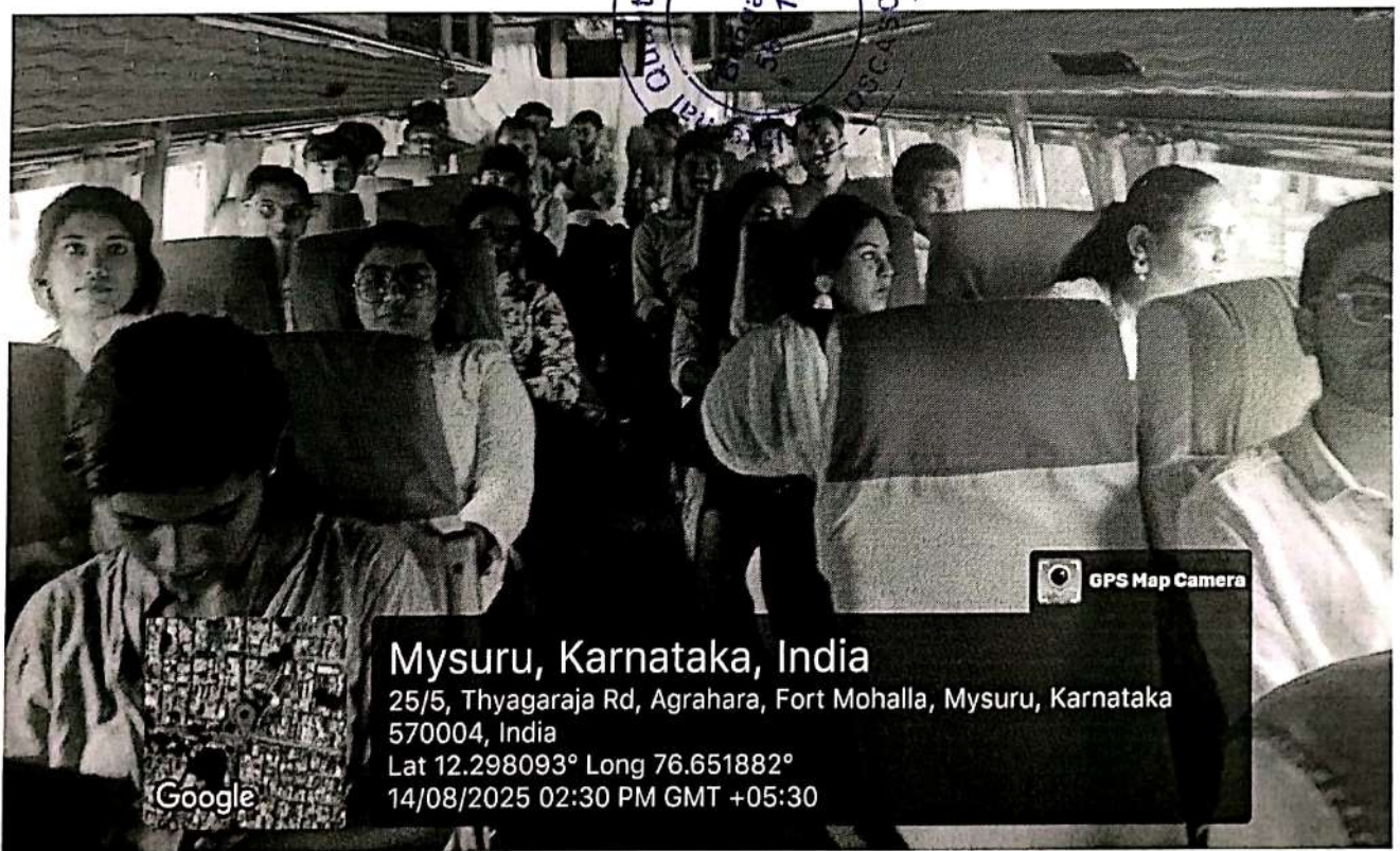
Figure 2- Students and the Faculty Coordinator seated the bus