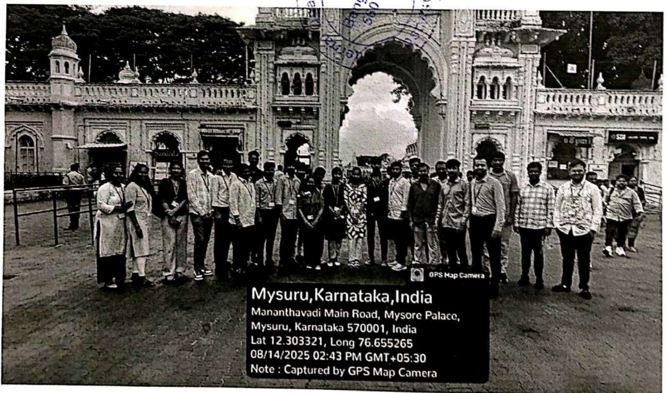
Figure 4 –Group Photo of students near the Mysore Palace