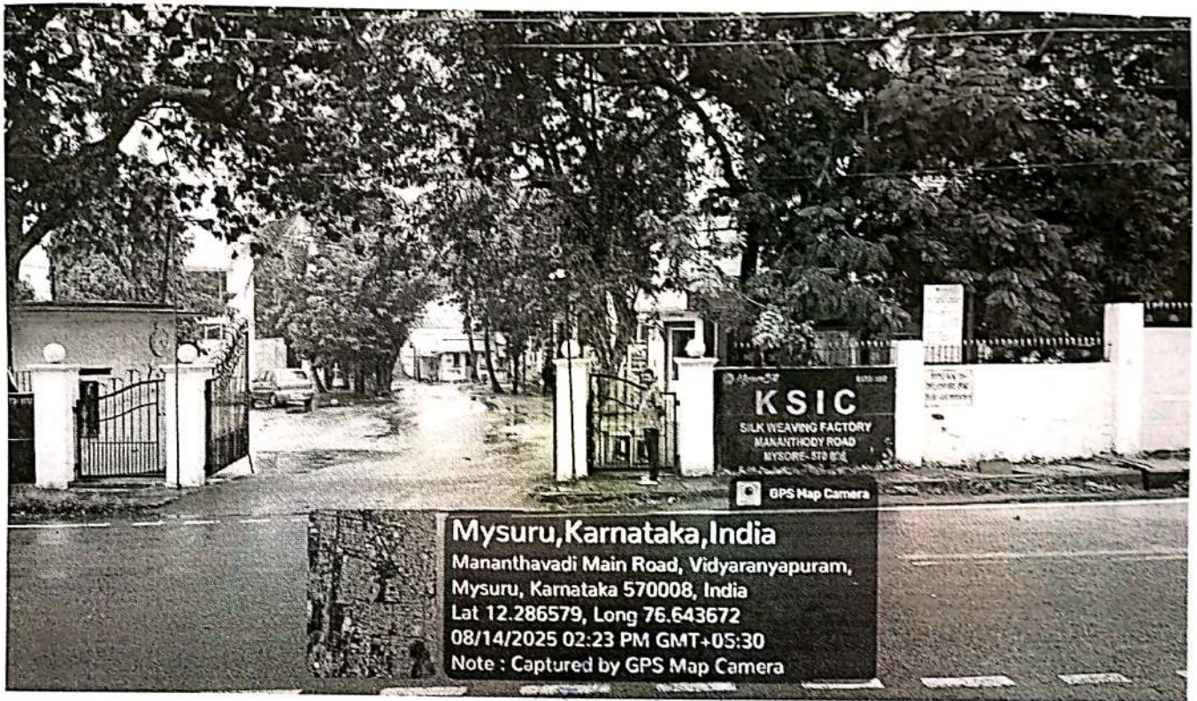
Figure 3 – Silk Weaving Factory, KSIC, Mysore entrance