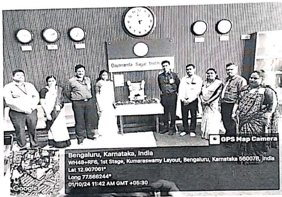
Faculty coordinators of Gandhi Study Cell along with HODs, IQAC Co-ordinator, and Principal