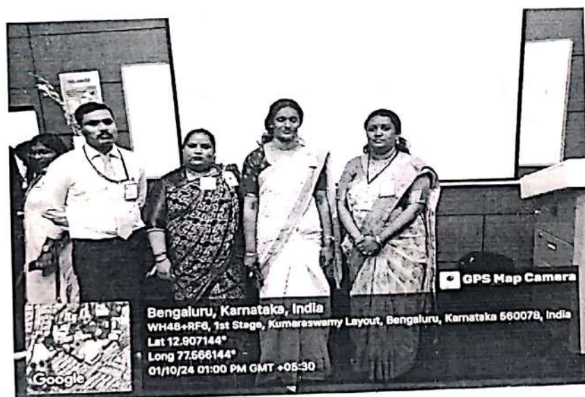
Faculty Co-ordinators with guest