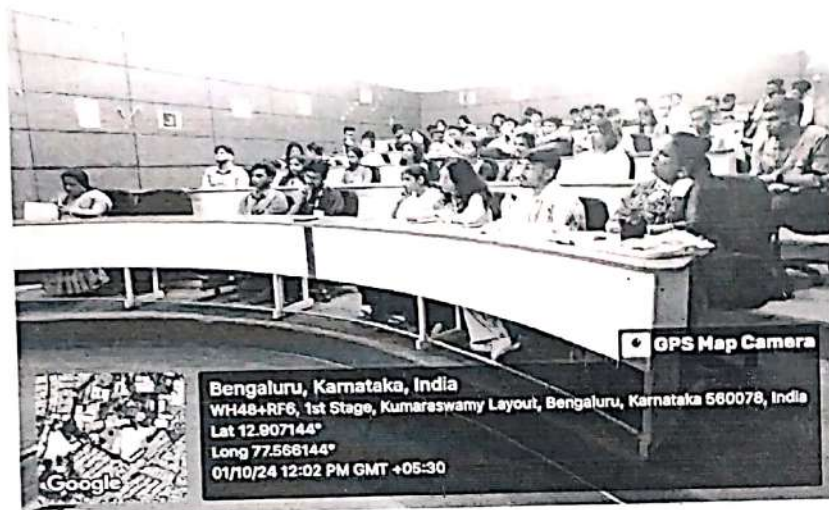
Students listening to the guest speaker