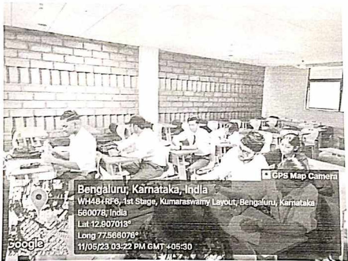
Students writing essays