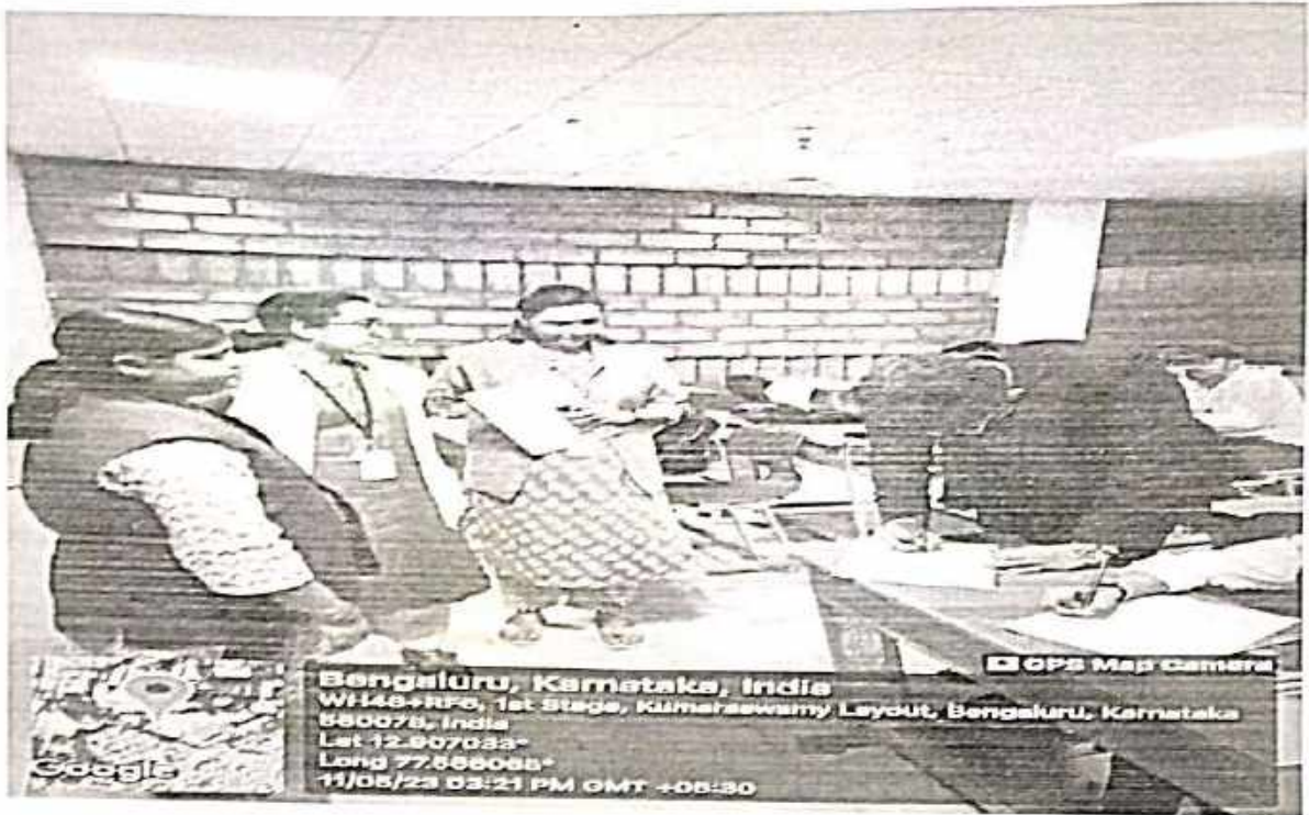
Faculty Coordinators taking enrolments