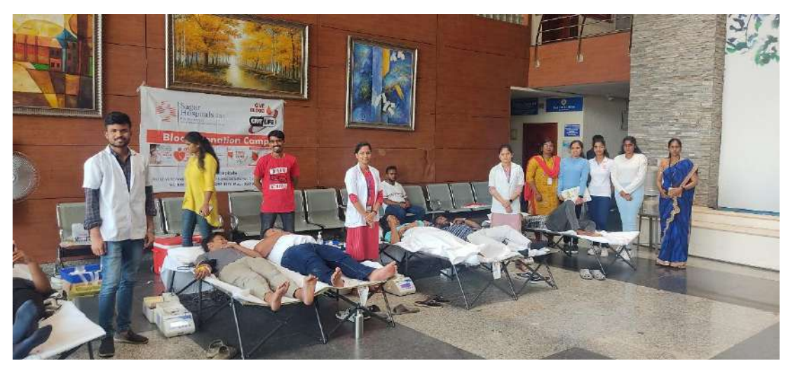
Pic 3: Donors Donating Blood