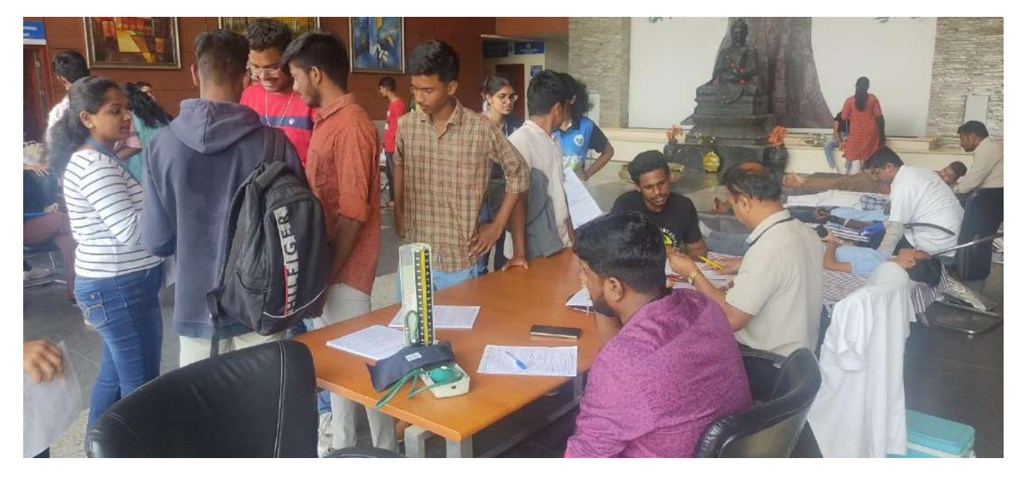
Pic 1: Registration of Donors