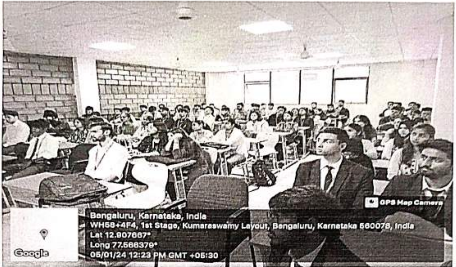
Pic-1 Students eagerly waiting for the session to begin.