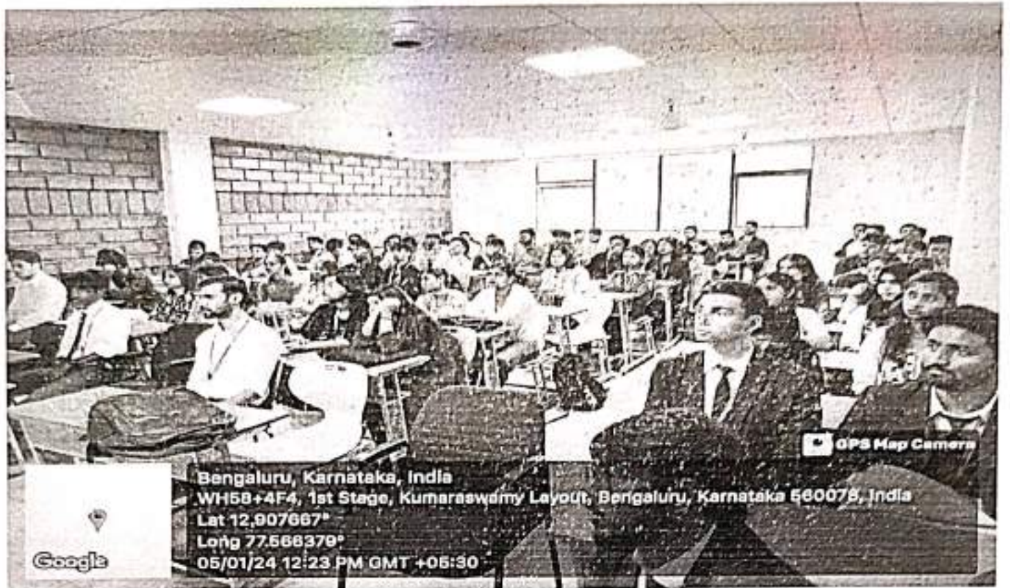
Pic-1 Students eagerly waiting for the session to begin.