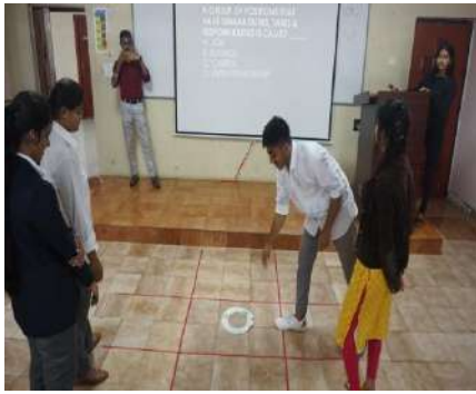
Pic 4- Team member placing the O Mark in the box