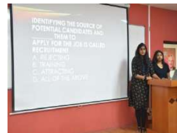
Pic 3- Questions being displayed