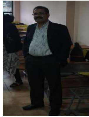
Pic 5- Principal-DSCASC watching the event