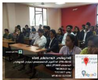
Pic 2- Participants for the event