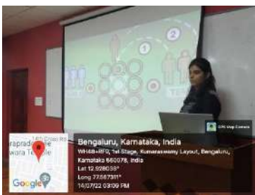
Pic 1- Briefing the rules of the Event

On 14th July 2022, HR Club –YUKTHI organized an event titled 'Hash-it-Out', for the members of the HR Club from 3:00 PM- 4:45 PM in Building No. 13 Room no. 508 & 509. The event commenced with a brief introduction of the rules and regulations of the event. Hash-it-Out was team-based, with two members representing a team. Hash-it-Out was an activity-based event where the conceptual knowledge of the students was tested along with the presence of mind of the student to make his/her move in the Tic-Tac-Toe game. The game is played on a grid that's 3 squares by 3 squares. One Team represents X, and the other opponent team will be O. Players will get the chance to play the game of Tic-Tac-Toe if they answer the question spontaneously, 30 second time is given for each team to answer. The first player to get 3 of his/her marks in a row (up, down, across, or diagonally) taking less time and answering the questions in their first attempt itself is considered the winner. Each question carried 5marks and the timeline given was 30 seconds, if the lifeline is taken 2 marks will be deducted. Fourteen Teams participated in the event. The team that took less time to complete the game and answer the questions with less time and taking no hints were identified as winners.