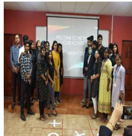
Pic 6- Opponent Teams waiting for their turn Pic 7- Team that finish the Hash-it –Out Pic 8-Student Organisers & Participants