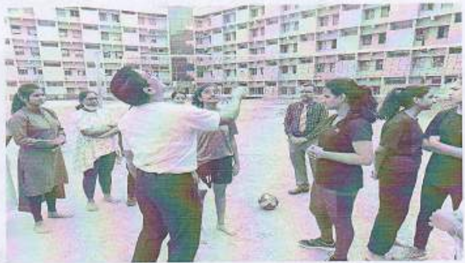
Physical Education director tossing for the Girls Volley Ball Match