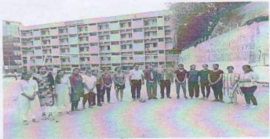
Girls Volley Ball team with P.E Teacher, HOD & Faculty