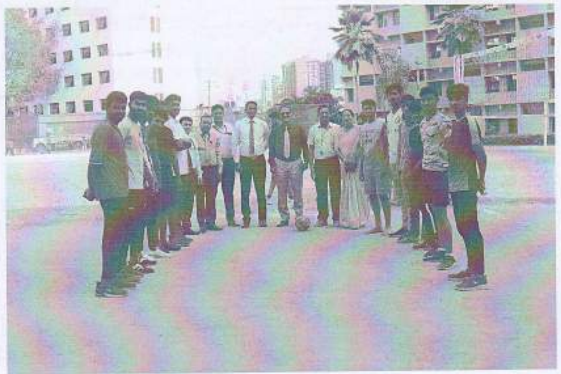
INGURATION OF VOLLEY BALL EVENT WITH ALL THE DIGNITARIES.

Department of Commerce and Management (UG)- BBA/B. Com conducted Sports Events for the Odd semester from 22 nd November 2023 to 29 th November 2023. Three Hundred Seventy students took part in various sports like Basketball, volleyball & Throw ball. For the benefit of the students the department had conducted sports activity under the guidance of Principal and HOD. It was a platform to show up their fitness and talent. Perseverance and tenacity are often the foundational traits of success. When these are combined with dedication and teamwork, the result is outstanding. The students of BBA/BCOM wear these very traits on their sleeve every semester. Together, they put on a spectacular display of courage, hard work, skill and brilliance during the Sports Meet. Sports have been an integral part of academic years immemorial. Keeping up the tradition, this semester too, Sports Meet was organized with the same flamboyant spirit among students, a venue to display their physical prowess, and gain hands on experience of organizing a sports-meet. Apart from commemorating victories, sports meet also aims at imparting lessons on camaraderie to students.