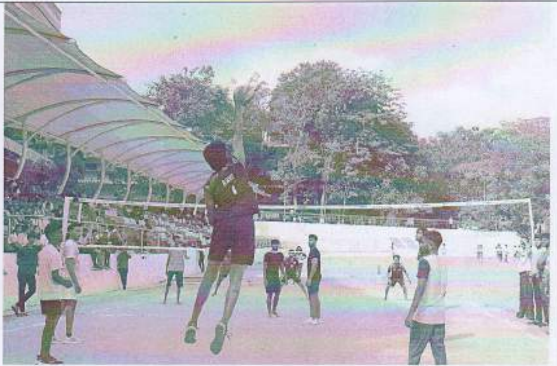
Captain is serving the ball to the opponent team.