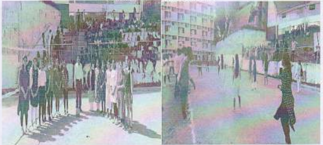
Throw Ball Team- Students were participating in Throw Ball Event