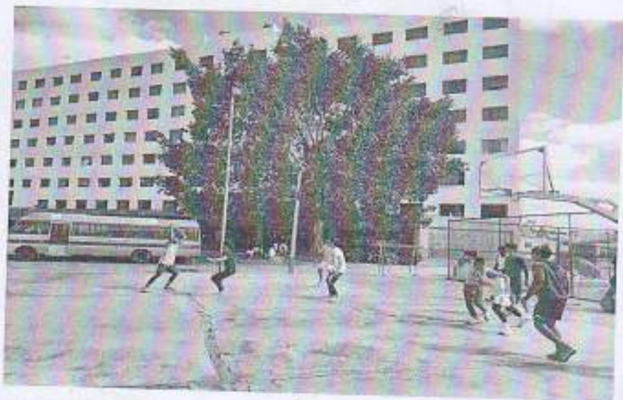
Students were engaging in defencing opponent team