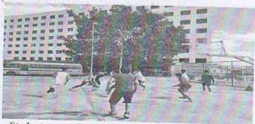
Students were playing Basket Ball match in the ground