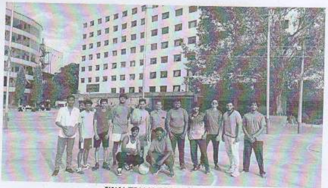
FINAL TEAMS OF BASKETBALL