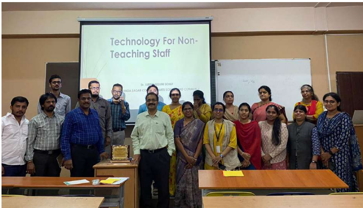
Participants and dignitaries