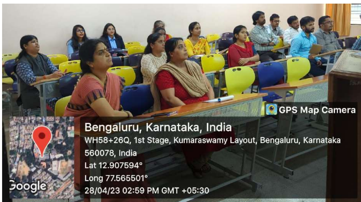
Participants Keenly listening