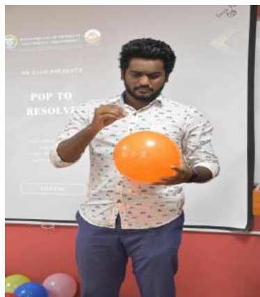
Pic 2- Briefing the rules of the Event