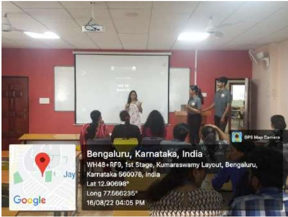
Pic 4- Participant analysing the topic