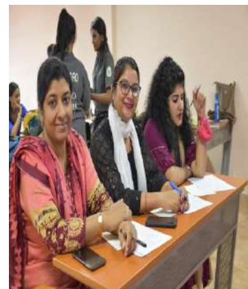
Pic 3- Judges for the Event