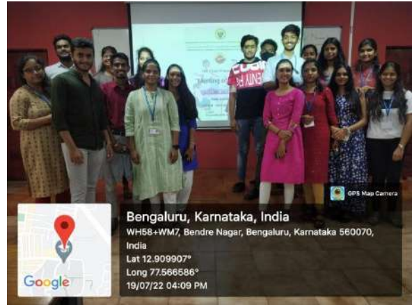
Pic 6- Participant of the event