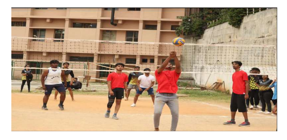
STUDENTS ARE TAKING PART IN VOLLEY BALL MATCH