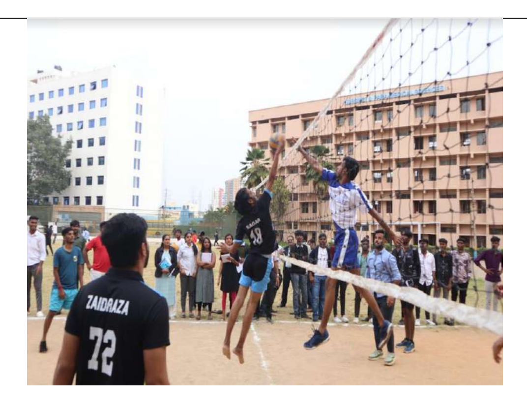
STUDENTS ARE TAKING PART IN VOLLEY BALL MATCH