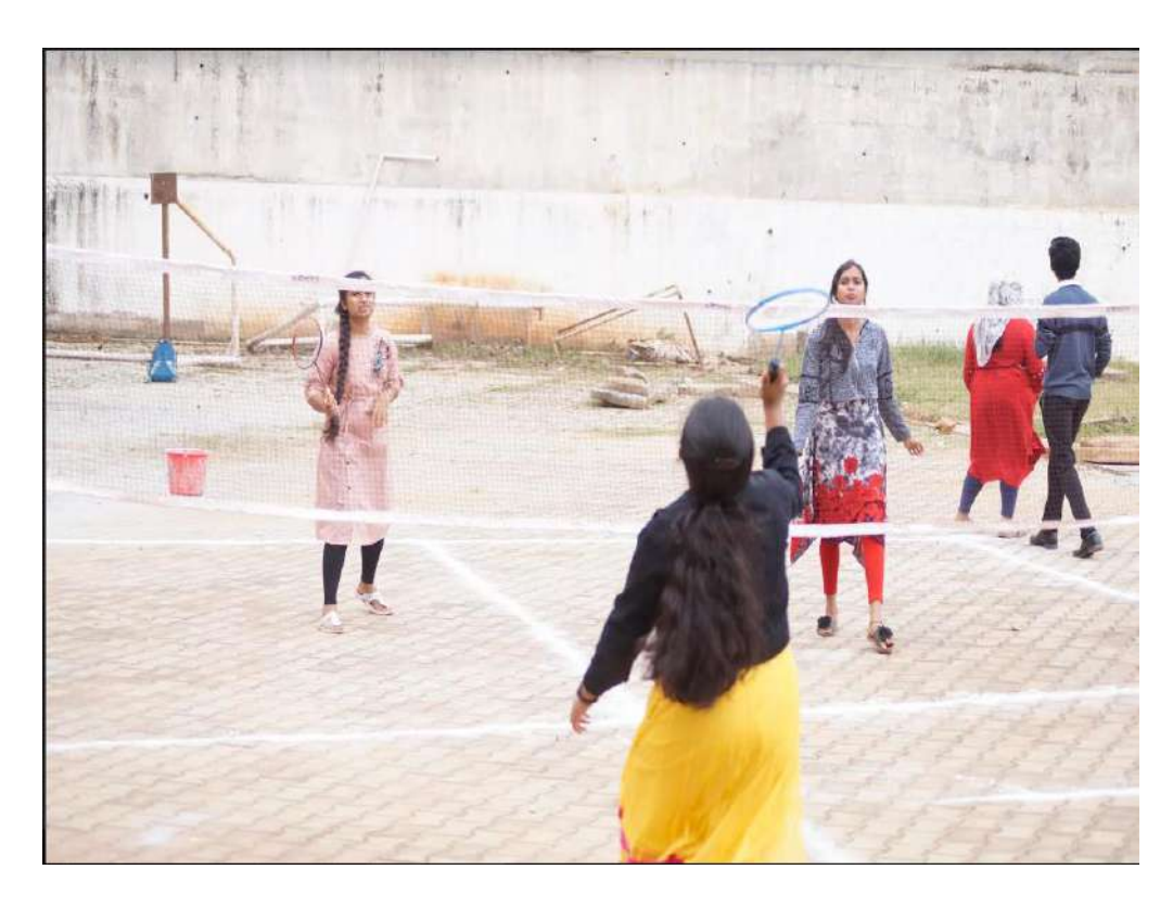
STUDENTS ARE TAKING PART IN SHUTTLE BADMINTON