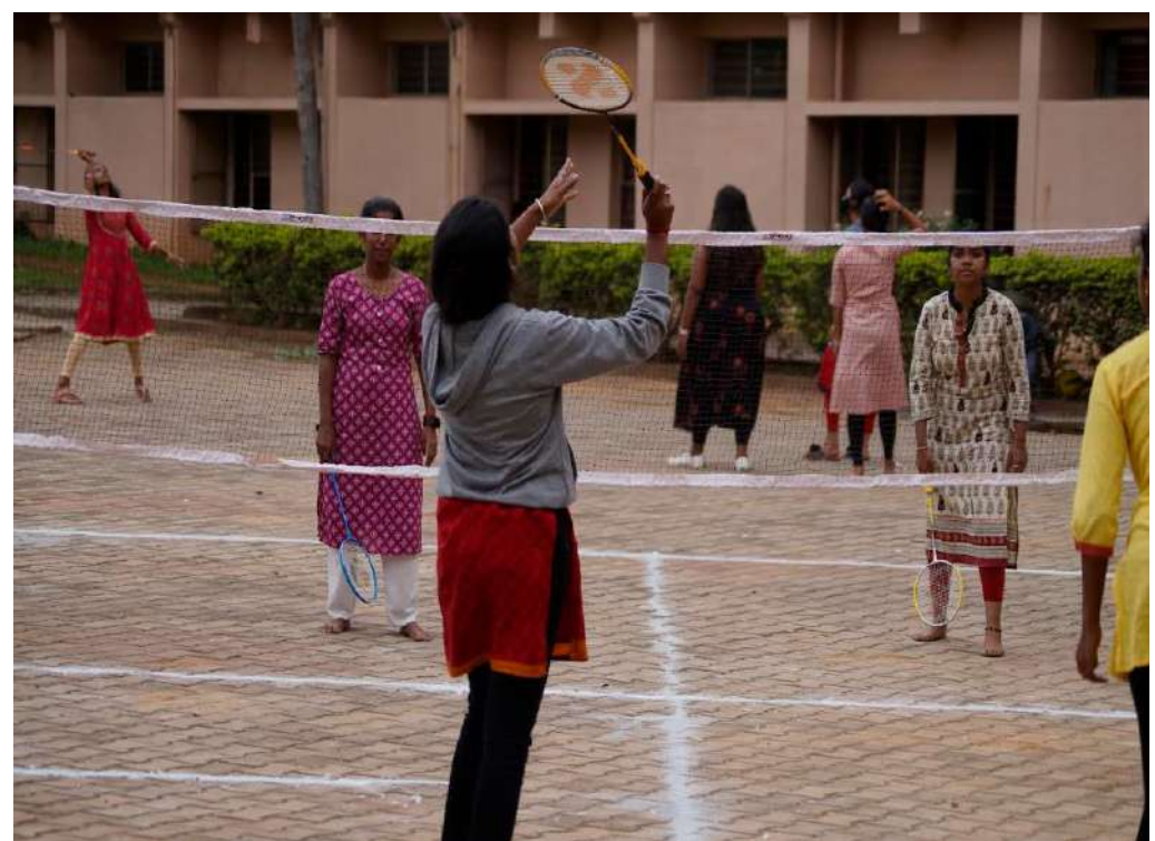
STUDENTS ARE TAKING PART IN SHUTTLE BADMINTON