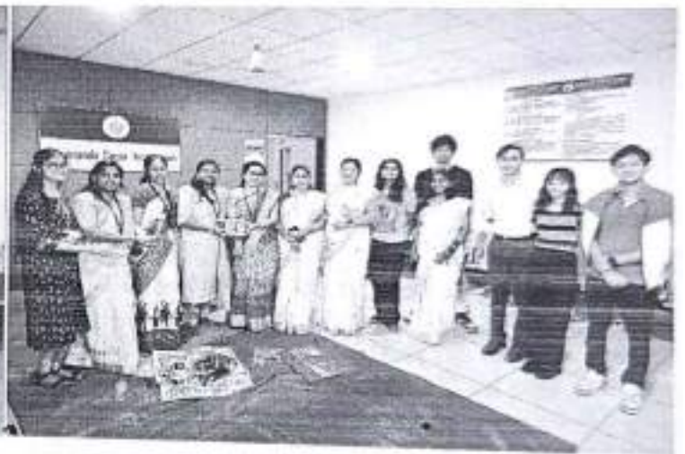
Group photo of Students and coordinators after the 'Plant Festival' event.