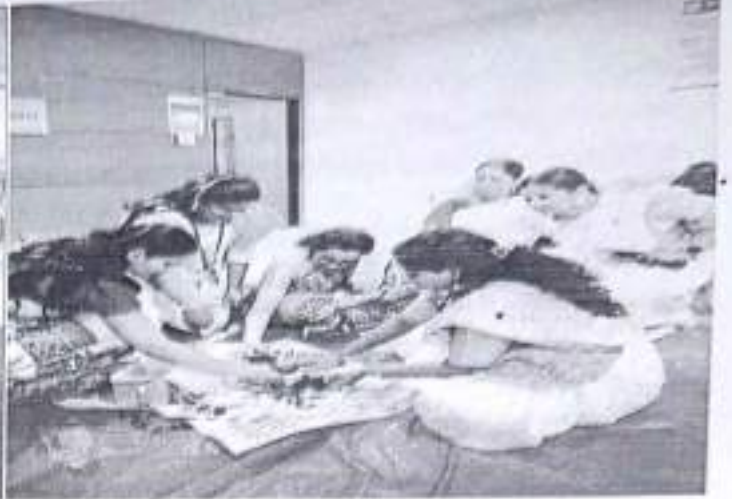
Students and faculties make seed ball for the 'Plant Festival' activity