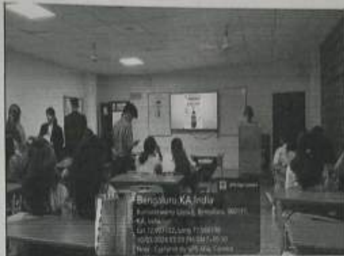
Student Coordinator briefing the participants about the activity.