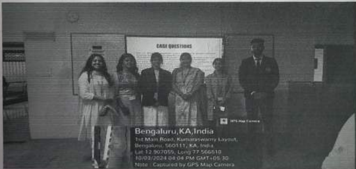
HR Club Student Coordinators