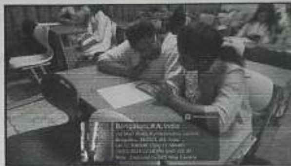
Students actively engaged in solving the case.