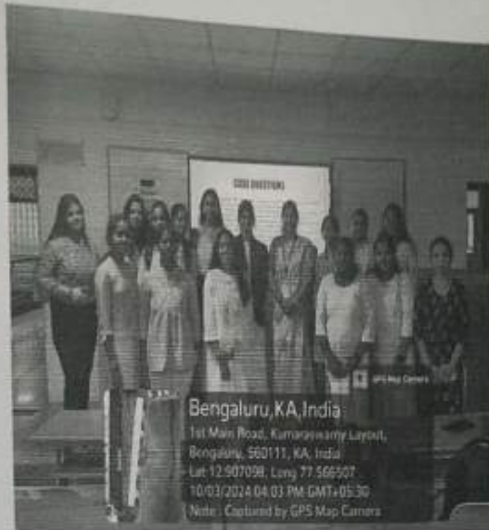
HR Faculty Coordinators with Participants and Student Coordinators.