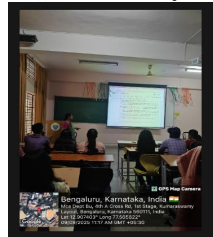
Pic(4) – Python code for rule based system