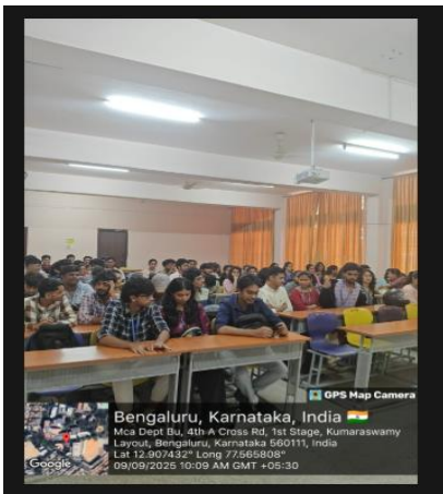
Pic(3) – Students participating in a question