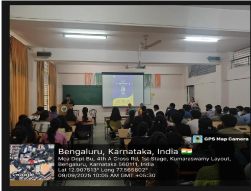
Pic(1) – Rule based systems-introduction