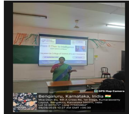
Pic(2)-Introduction to the speaker