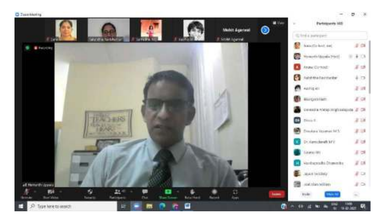
Photo1: HOD addressing the students