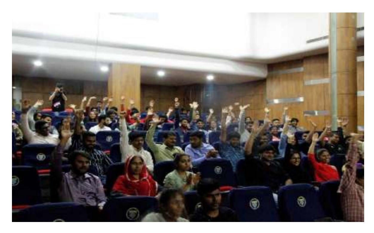
4. Voting for Office Bearers