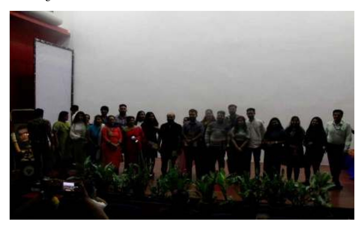
5. Group photo