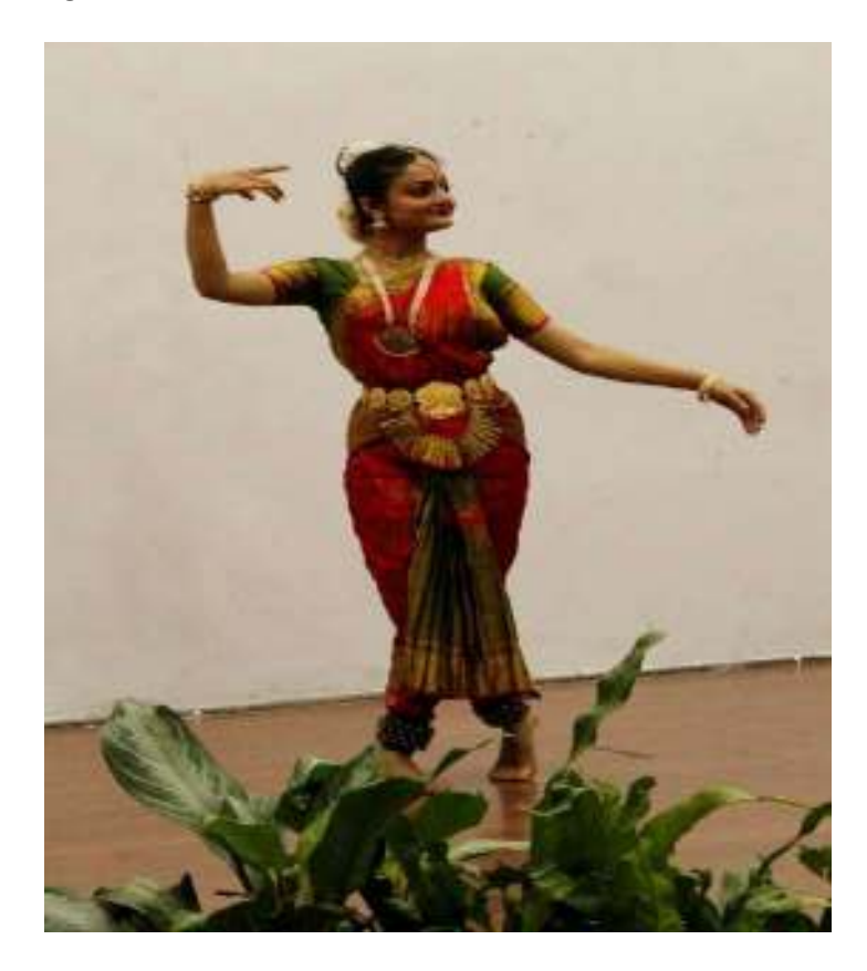
3. Cultural Program