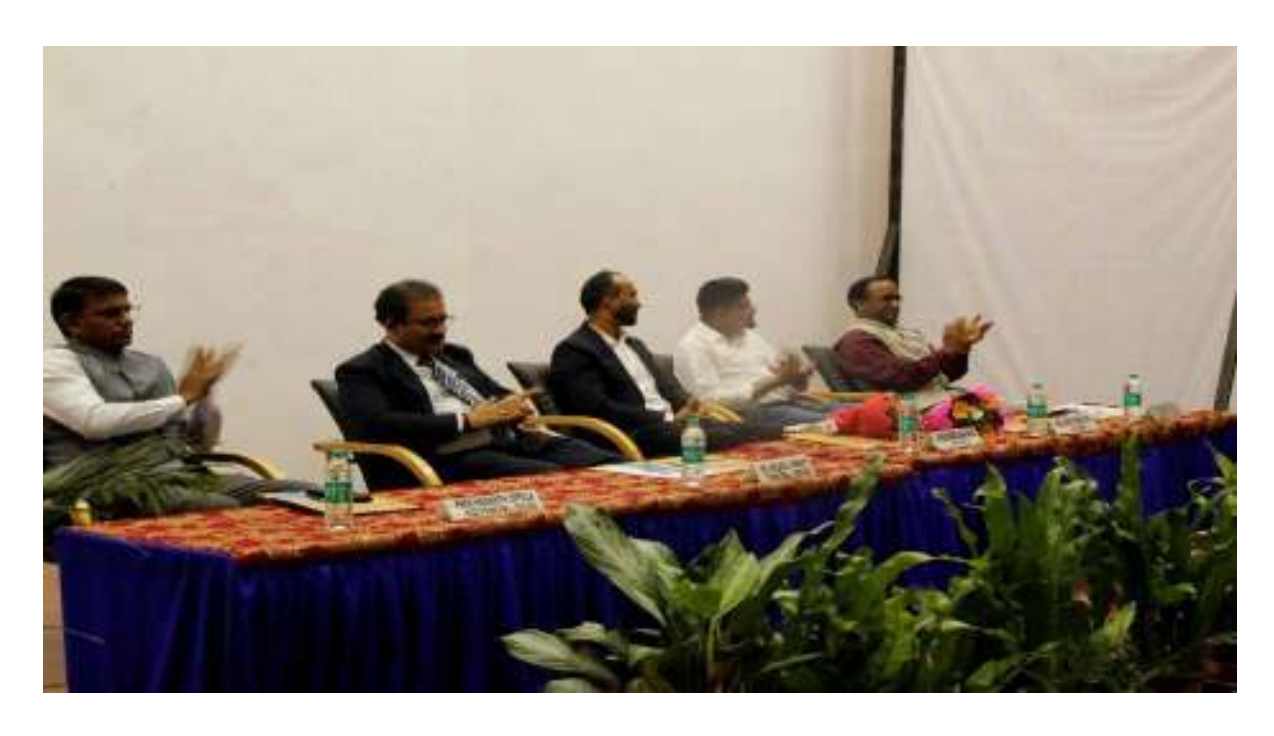
2. \ \mathsf{Dignitaries} \ \mathsf{on} \ \mathsf{the} \ \mathsf{dais}