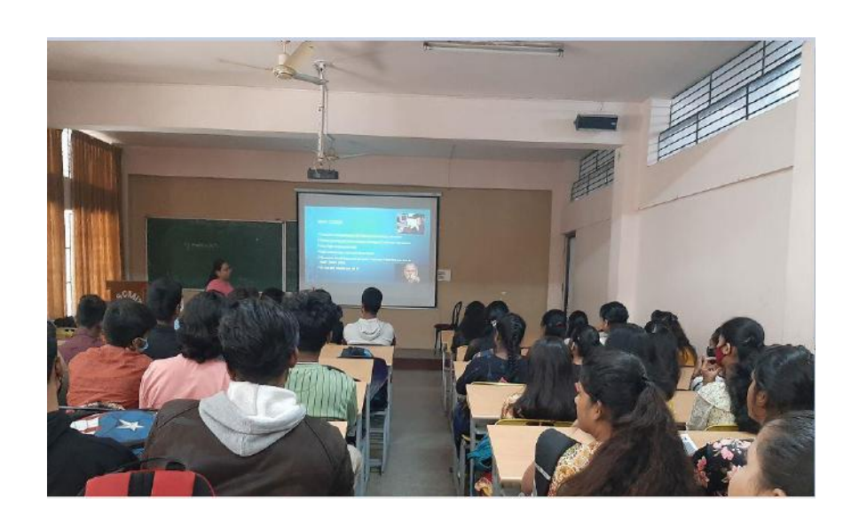
Photo3- Student participation