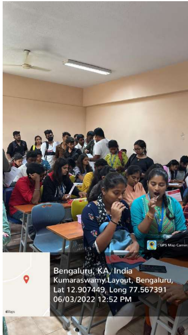
2 Students taking Swab Test