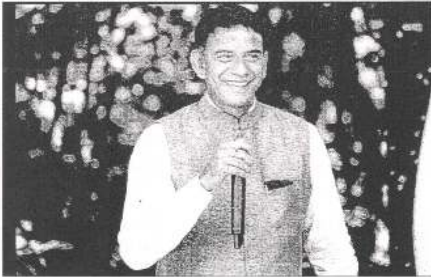
Pic 3: Vice Principal and HOD-BCA addressing the crowd