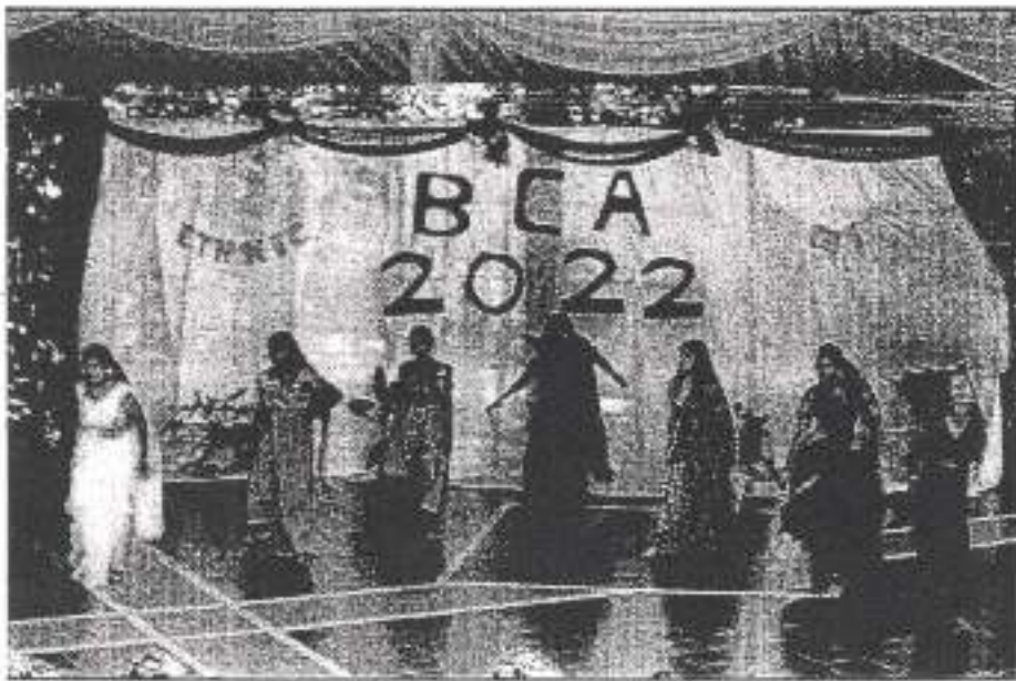
Pic 4 : Performance by BCA girls of 1st Sem.