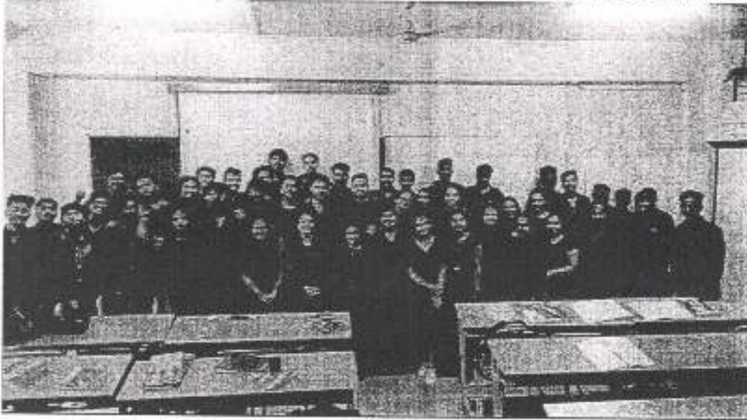
Day 1 : Black on Black theme -4 th BCA 'A'