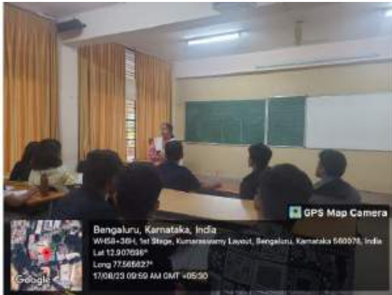
photo 1- Giving Instructions to students