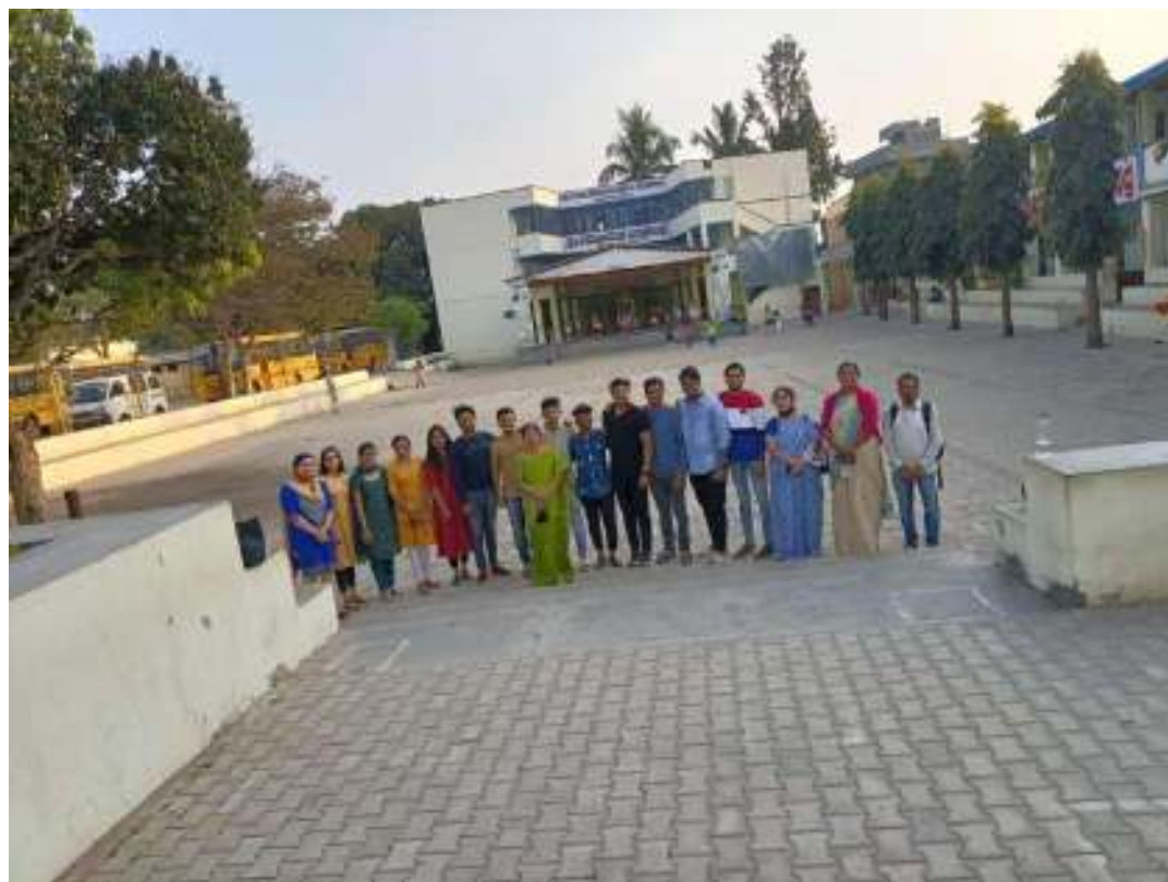
1. At Swami Vivekananda Vidya Kendra , Hoskote

ISR Cell organized an Internship program on "Education transformation through teacher empowerment leading to learning-ETTELL" envisioned by Sathya Educare competency Trust, Bangalore students visited Swami Vivekananda Vidya Kendra , Hoskote on February 16 th 2022 as part of the project students were involved in spreading awareness on MCQ through story telling creative way of making them understand MCQ and developing quick reading skills. During the internship students demonstrated good skills with a self-motivation attitude to learn new things and has understood ground realities of school level. Students were trained with working lunch, travel and lunch was taken care by Sathya Educare competency Trust, Bangalore.