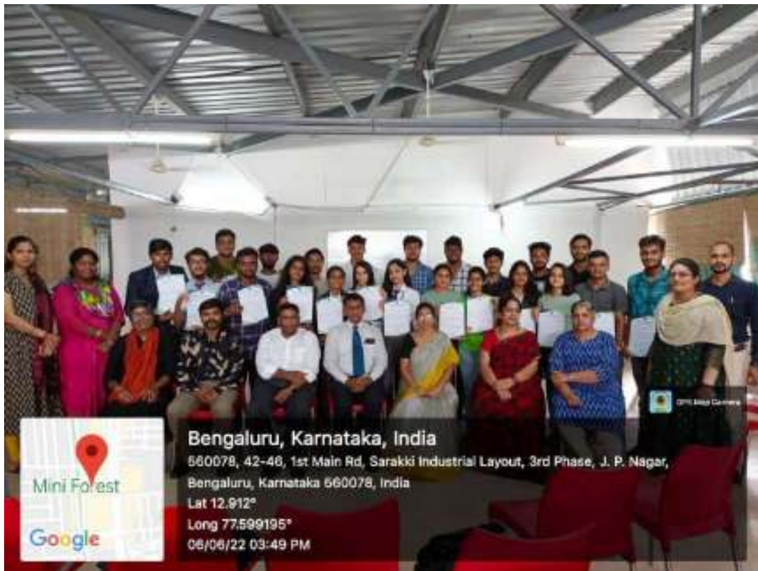
3. Group photo