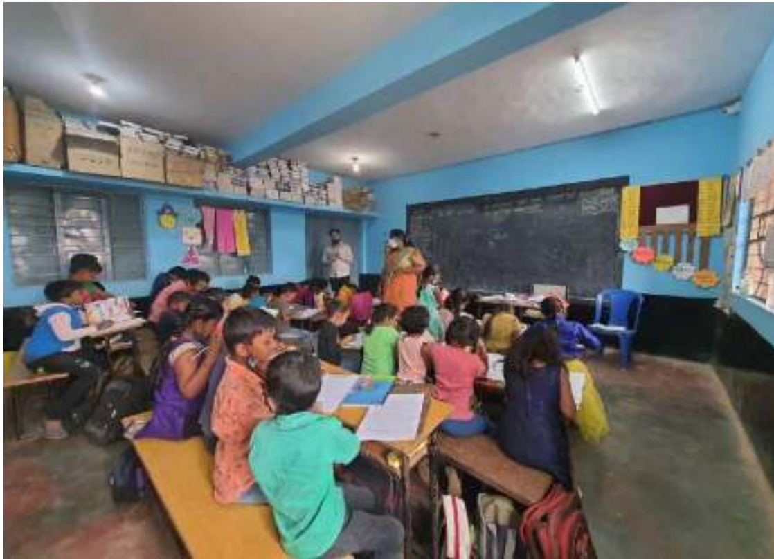
2. Student explaining about MCQ