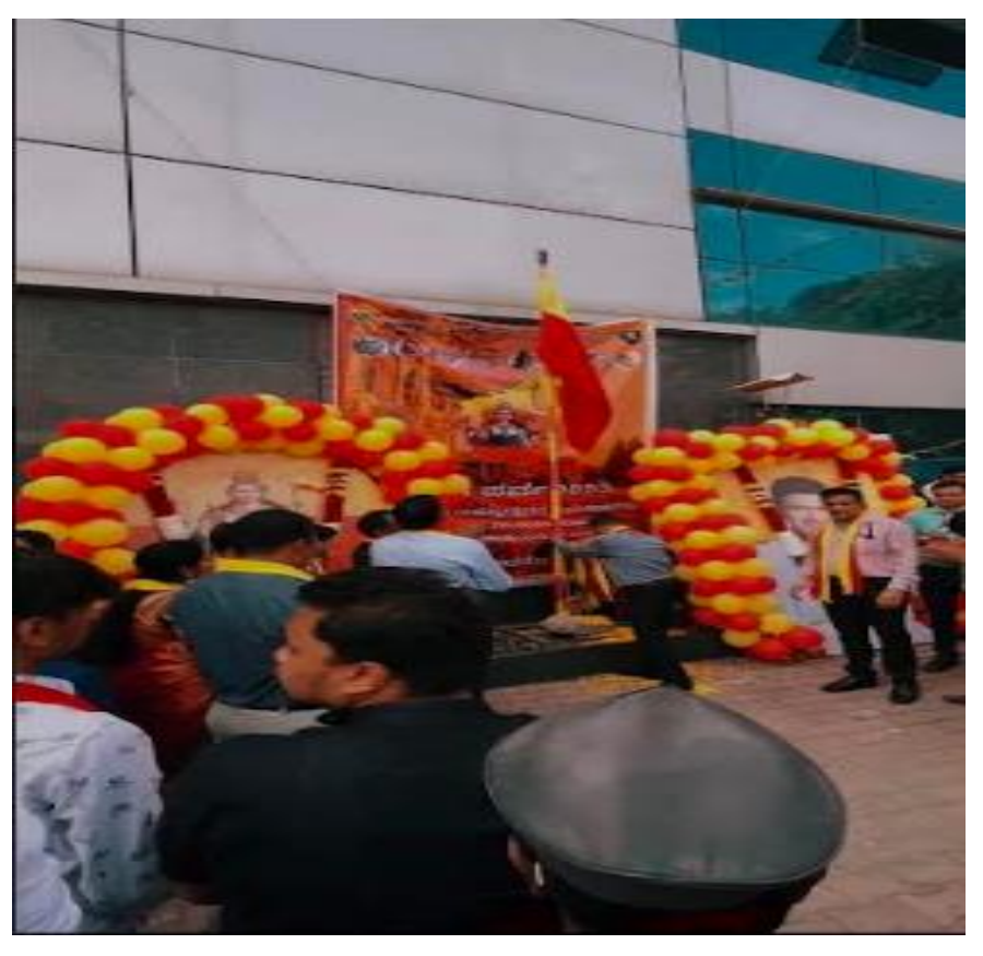
Pic-5 Flog hoisting