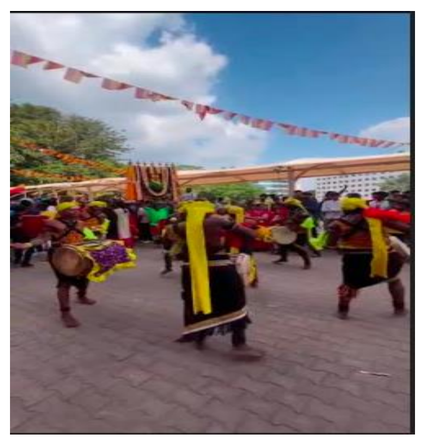
Pic-4 Dolu kunitha