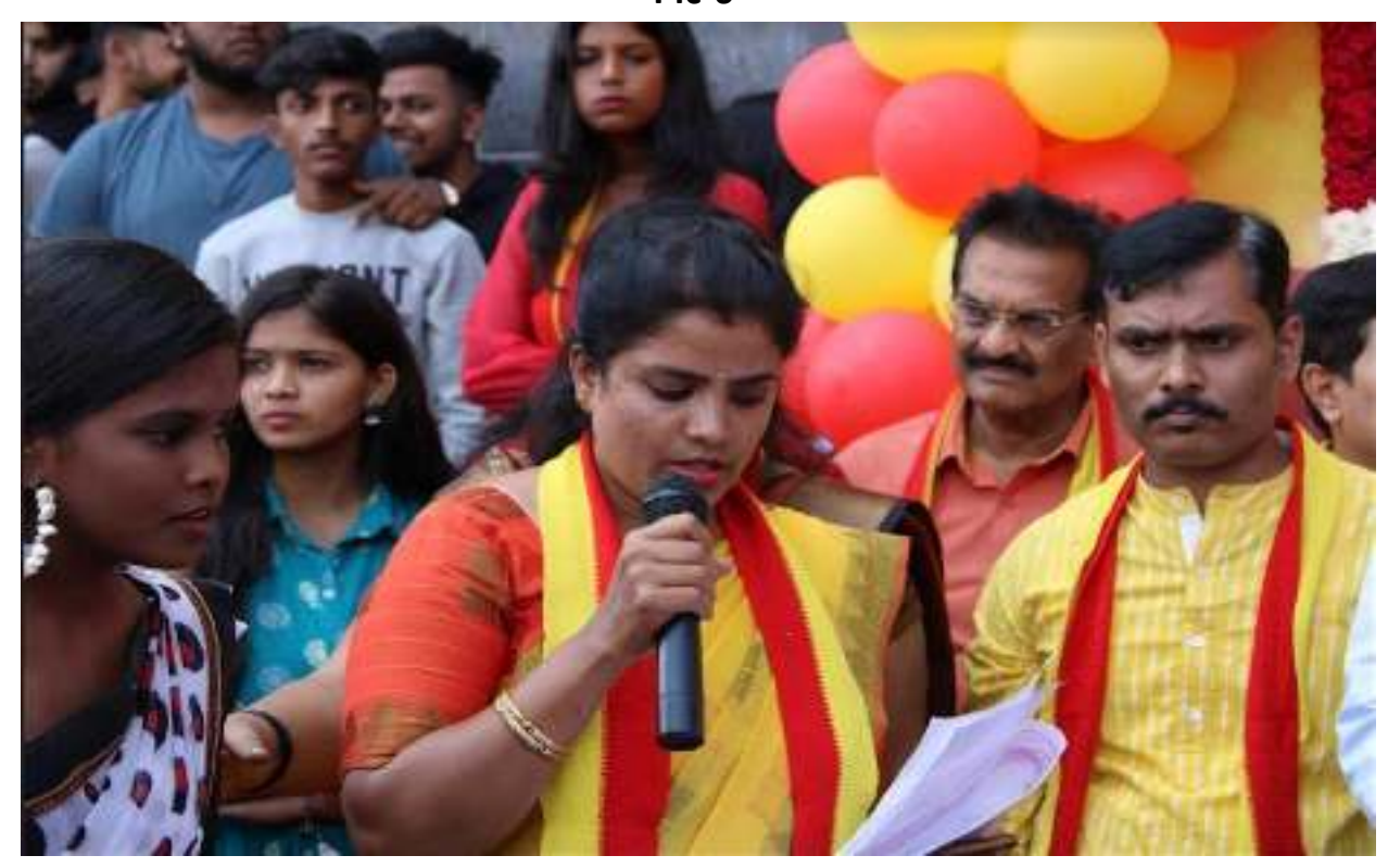
Pic-7 Prize Distributing