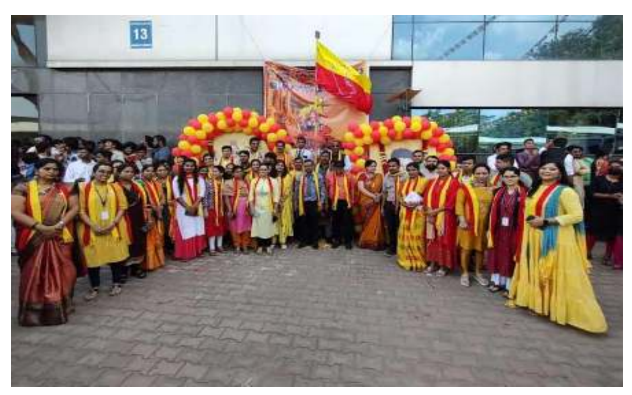
PIC-3 all faculties