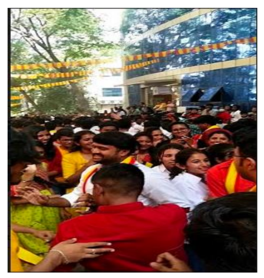
Pic-10 all Students

Attendance All BCA 360 Students As per our records