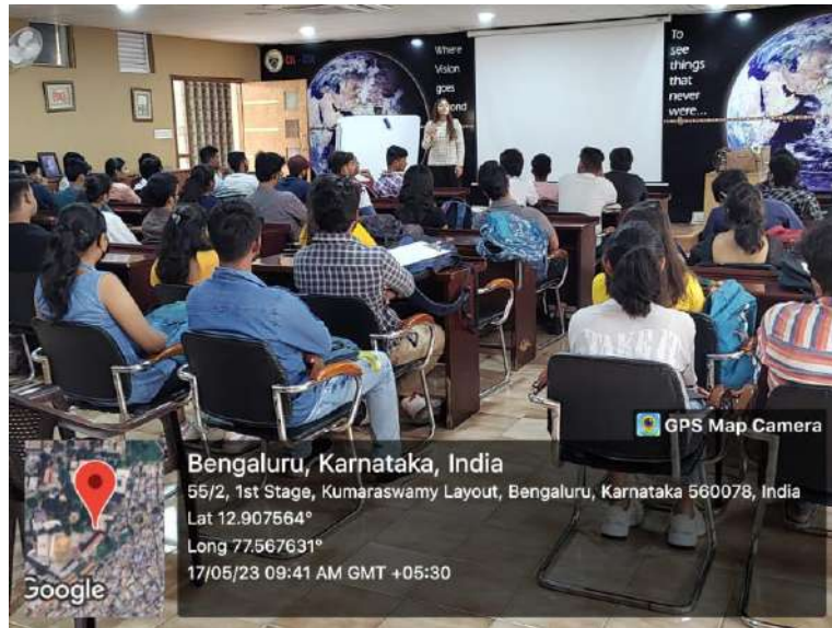
Photo 5- Student listening to the trainer