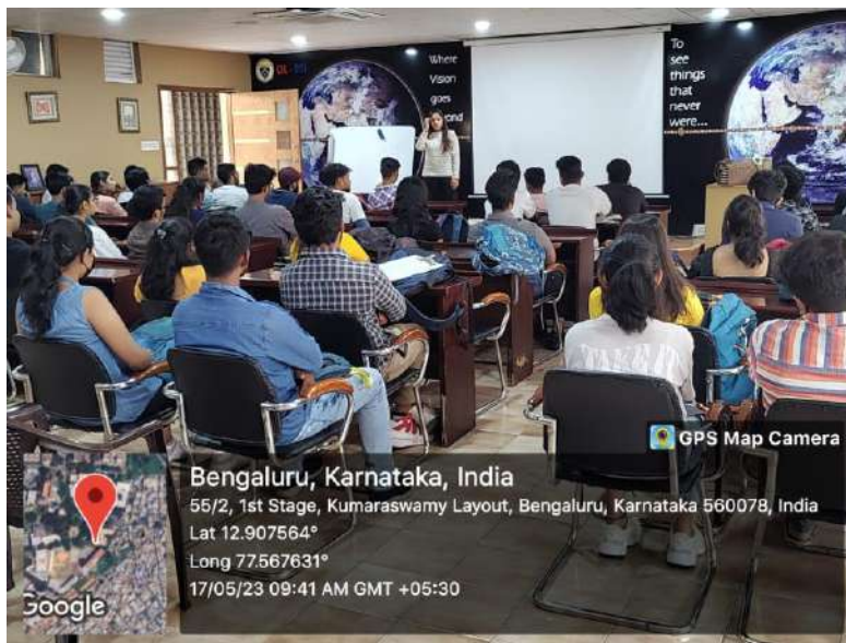
photo 6- Student listening to the trainer