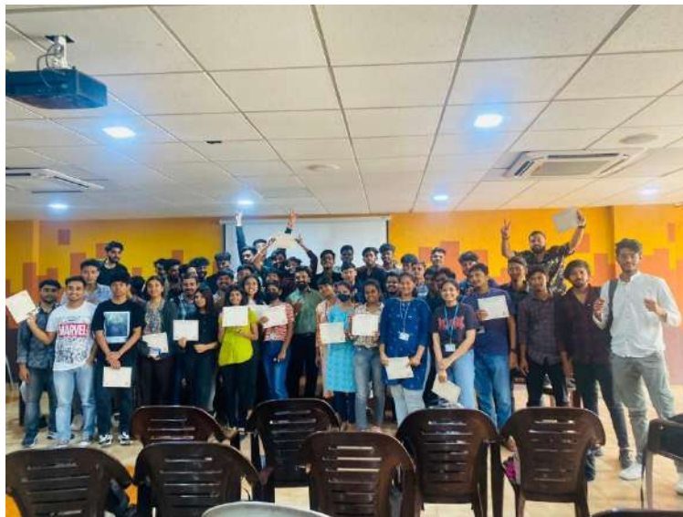
Photo 1- A group pic of students with Trainer