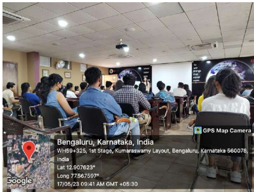
Photo 4 - Speaker Explanation