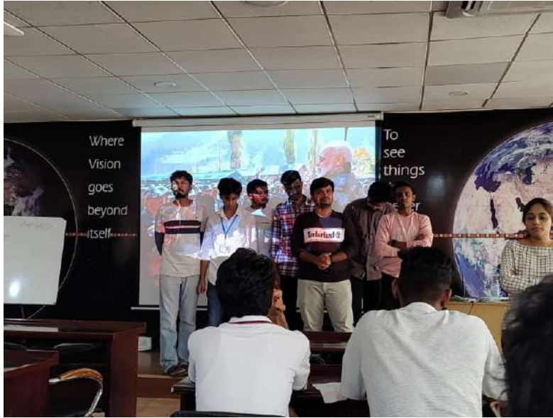
Photo 3- Student Participating in Activity