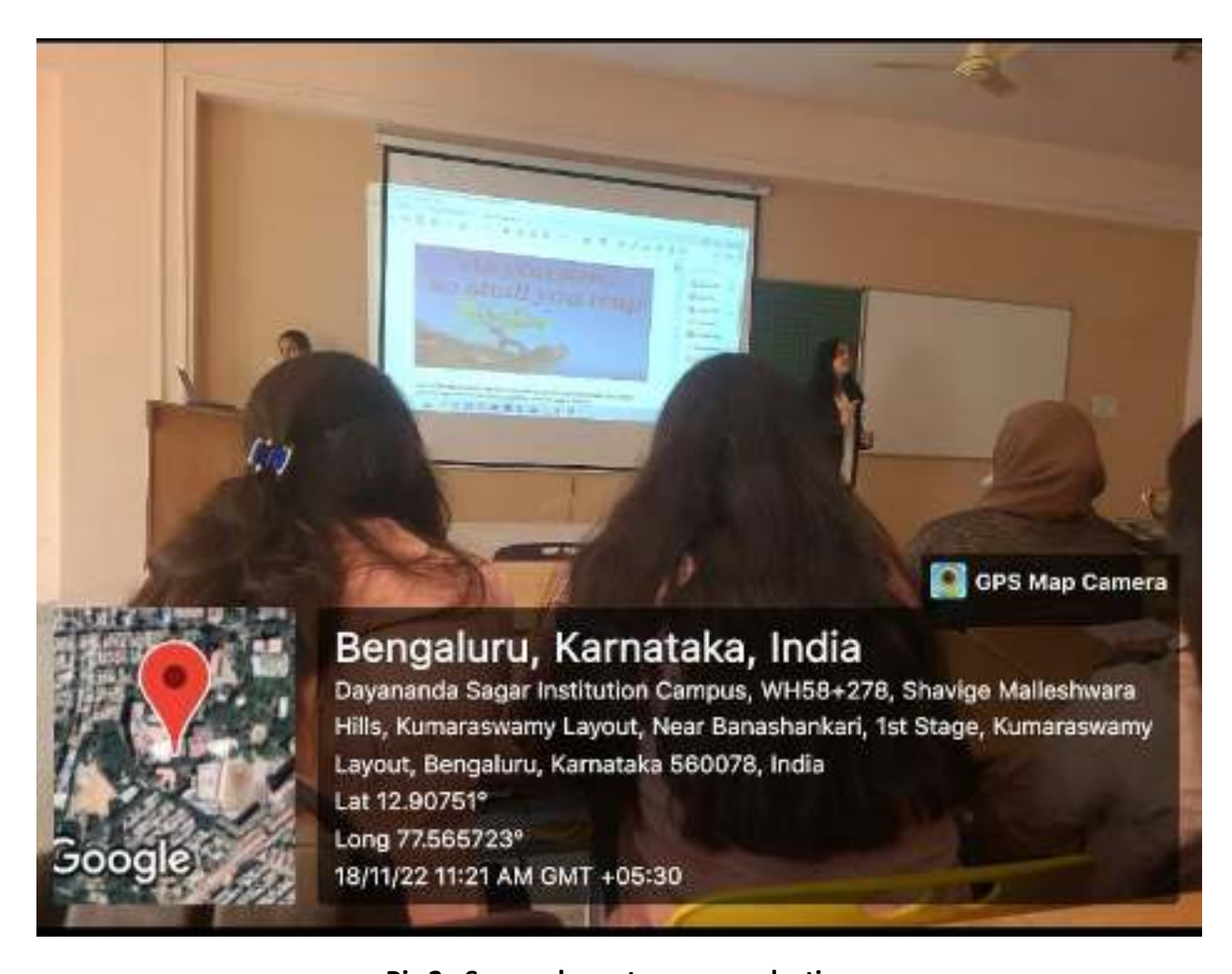
Pic 3 : Sow a character , reap a destiny