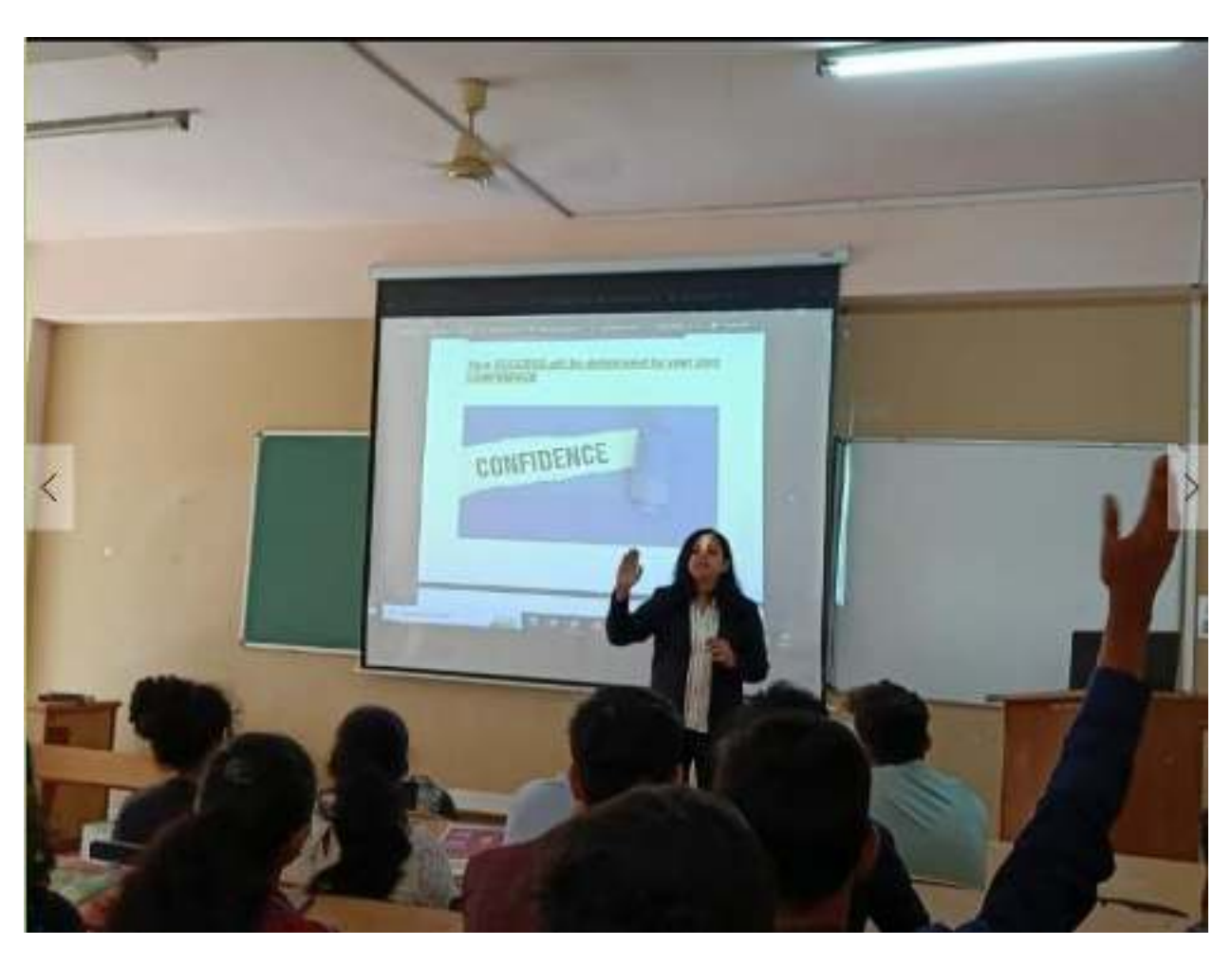
Pic 4: Confidence is important