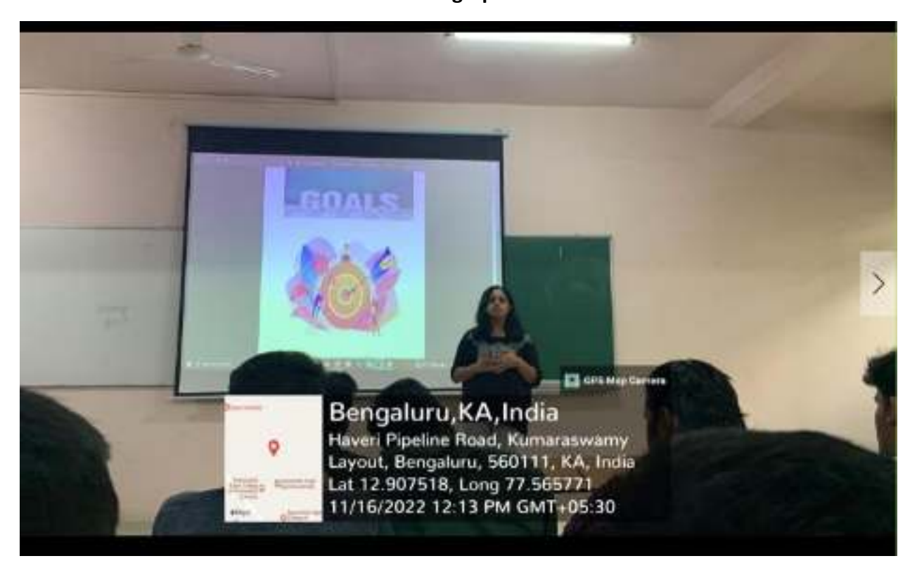
Pic 1: Sushma explaining about goals