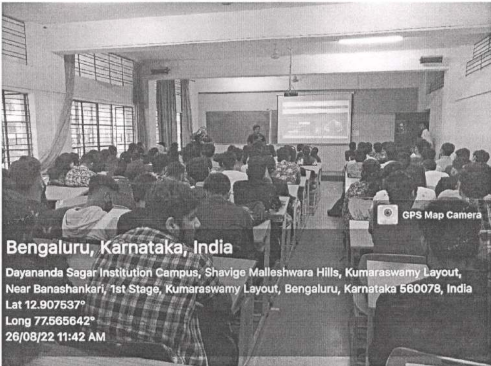
Photo 2 - Trainer telling about free and paid version

Dayananda Sagar Institution Campus, Shavige Malleshwara Hills, Kumaraswamy Layout, Near Banashankari, 1st Stage, Kumaraswamy Layout, Bengaluru, Karnataka 560078, India Lat 12.907537° Long 77.565642° 26/08/22 11:42 AM