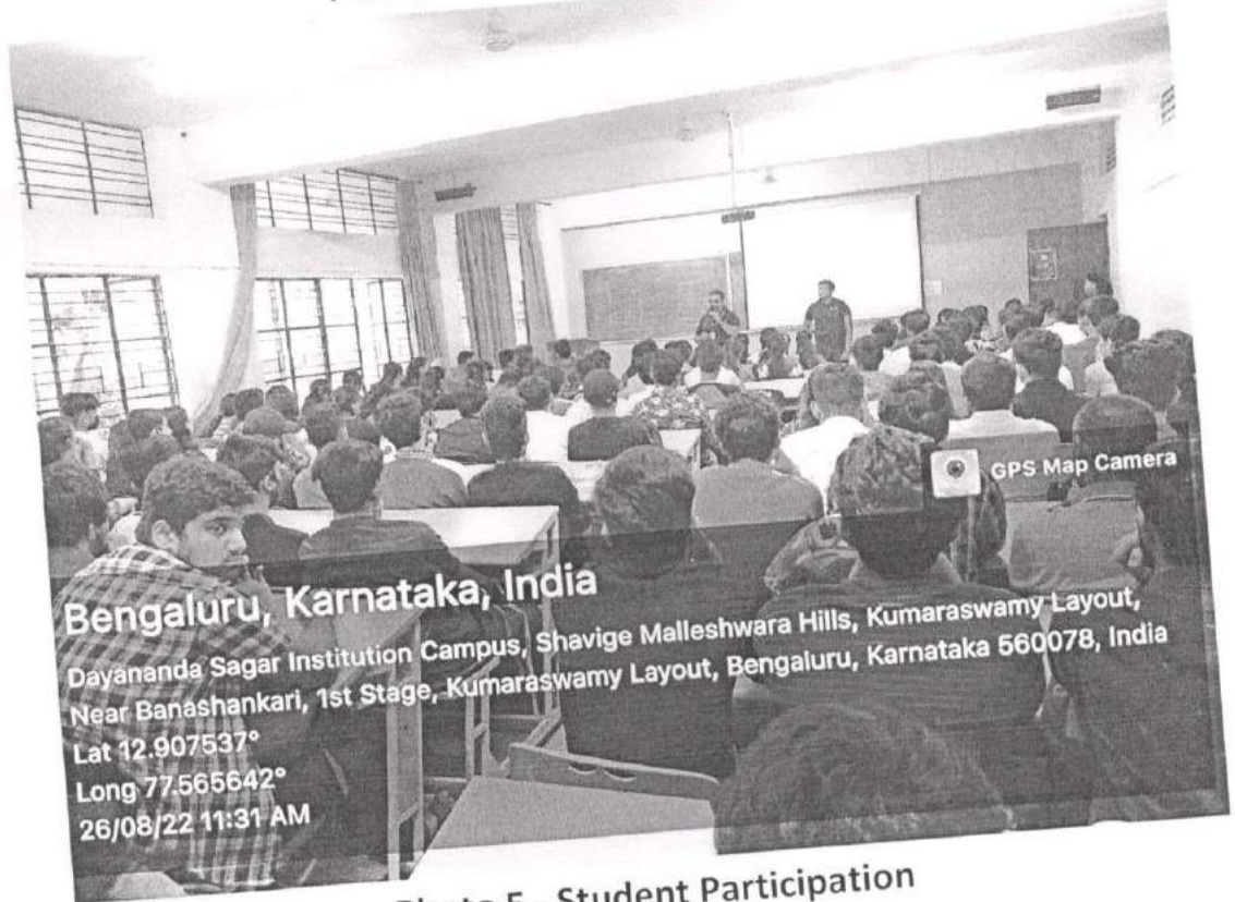
Photo 5 - Student Participation