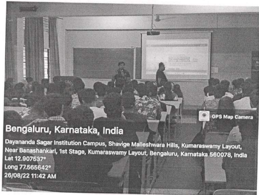
Photo 1 -Session Started with introduction of future skills