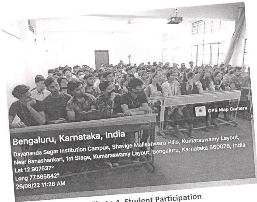
Photo 4- Student Participation