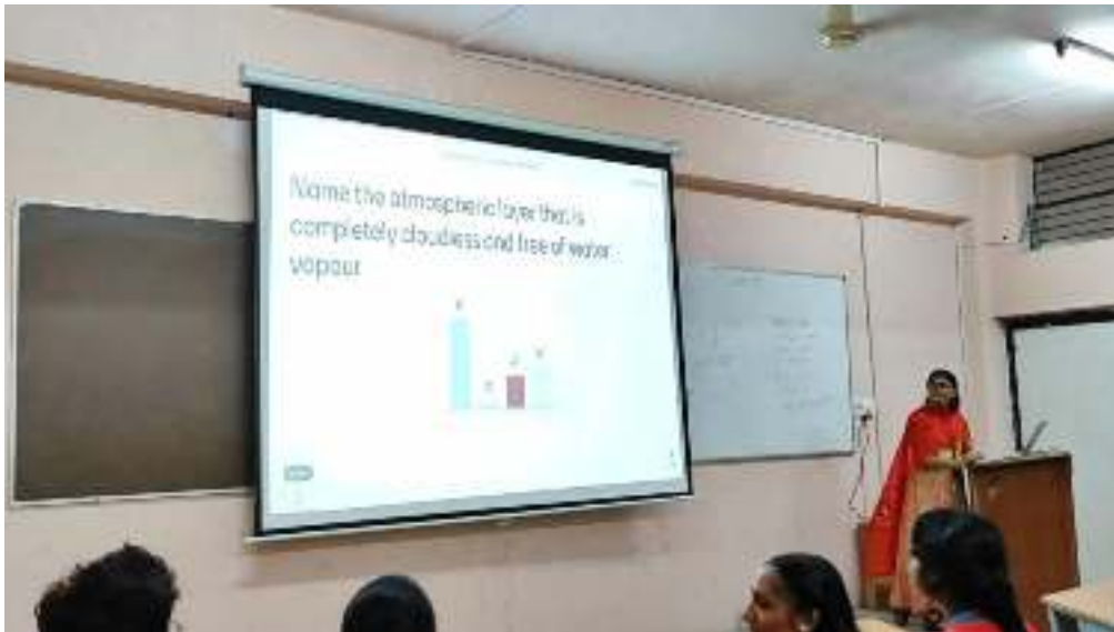
1. Quiz Conducted using menti.com