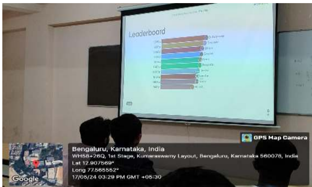
6. Winners Announcement