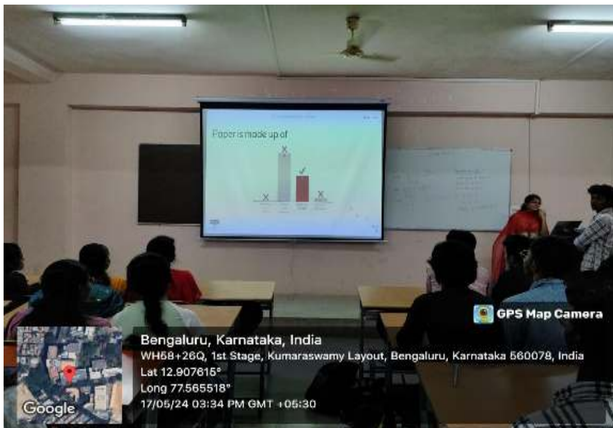
5. Answer for a Question