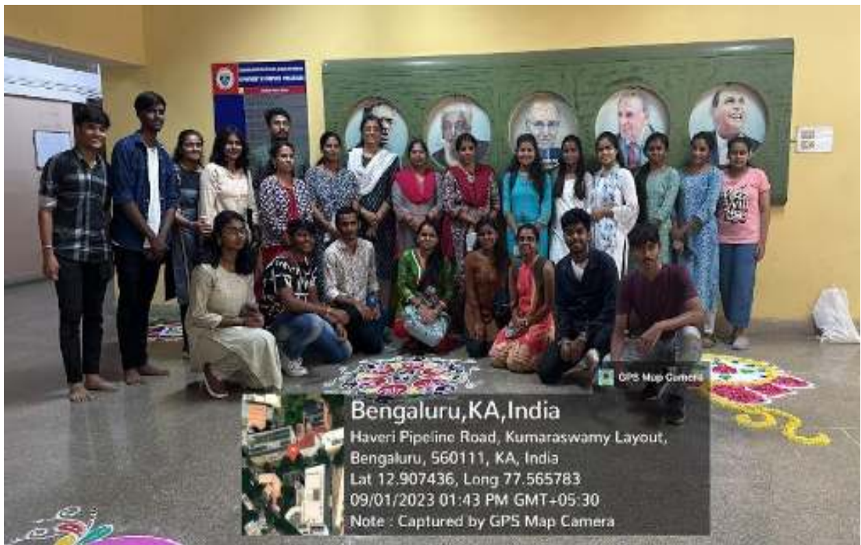
Rangoli participants with judges