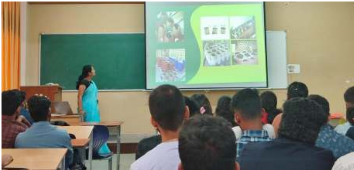
3. Speaker explains Waste Management