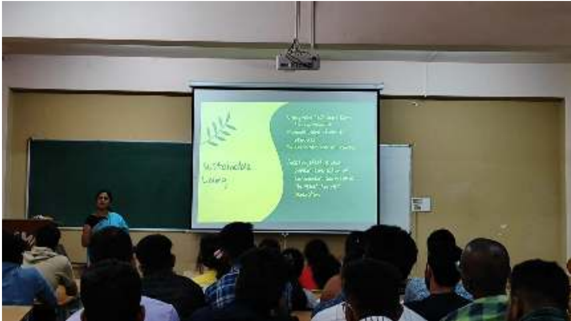
2. Speaker Explains Sustainable Living