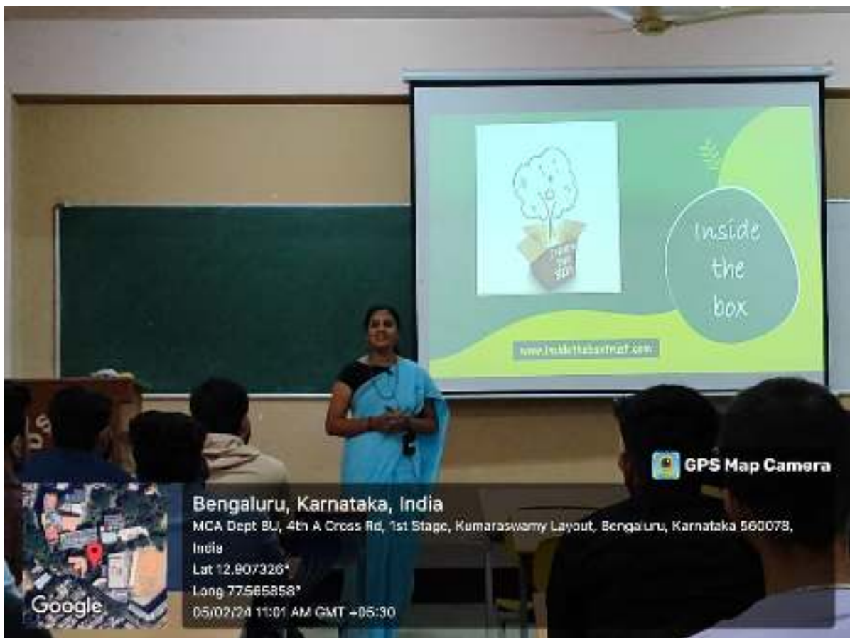
1. Speaker explains Environmental safety