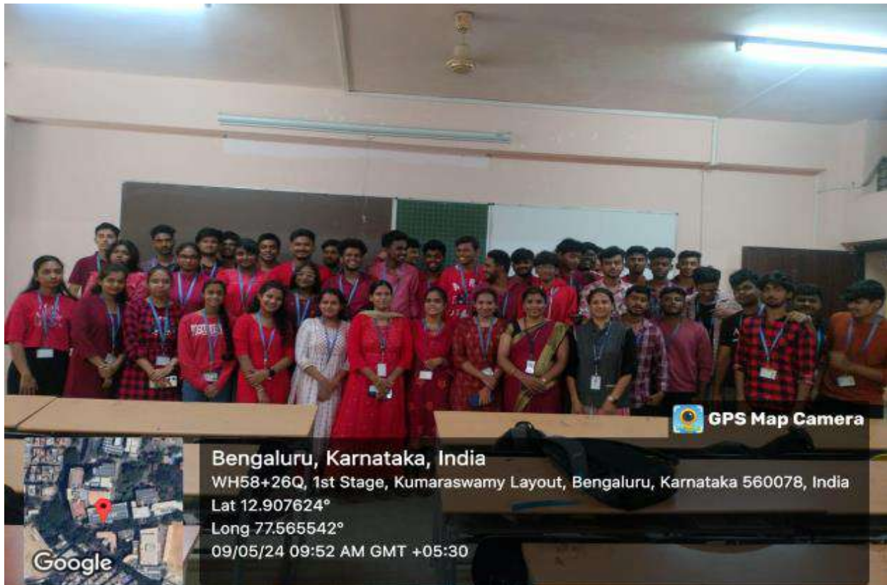
Photo-17.II BCA 'A' section