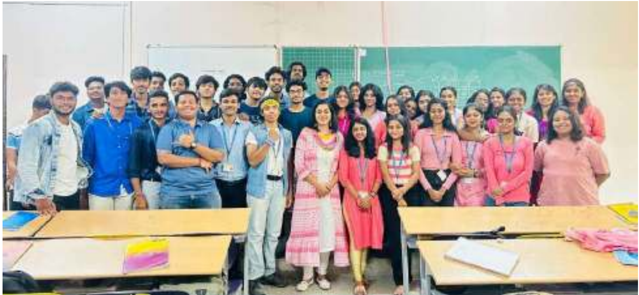
Photo 5.II BCA B Section