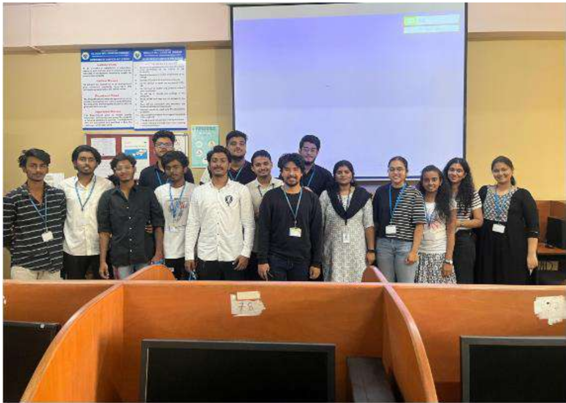
Photo-14.VI BCA 'B' section