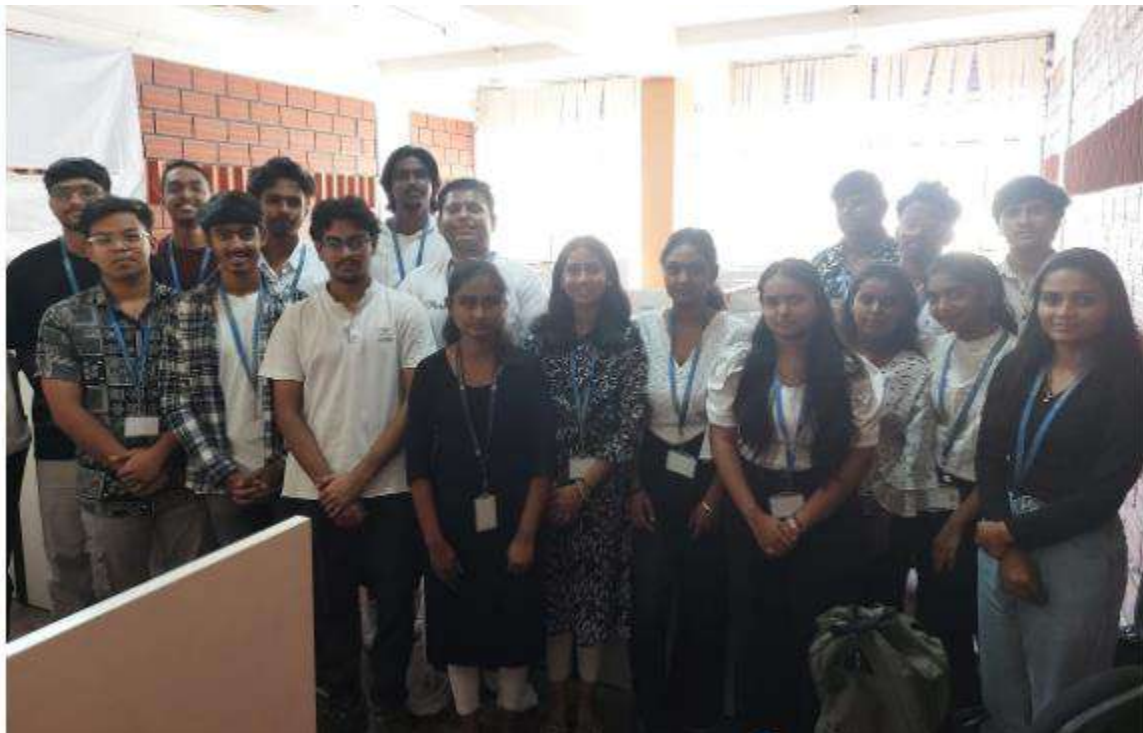
Photo-14.II BCA 'B' section