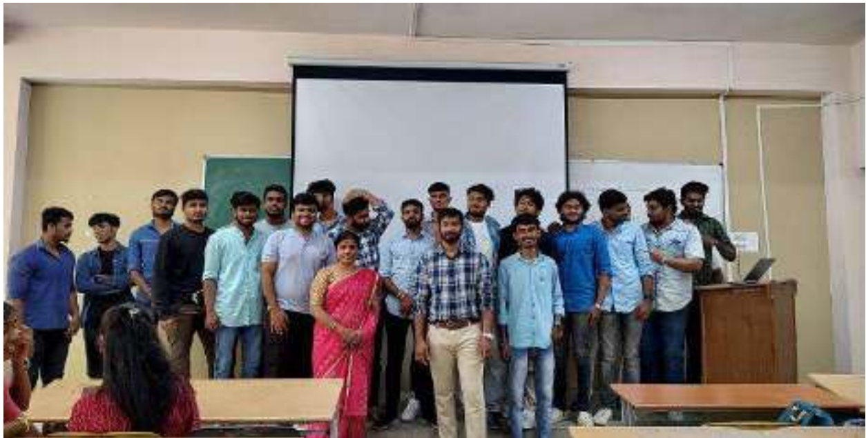
PHOTO 3.VI BCA'A' SECTION