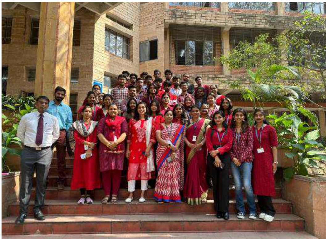
Photo-21.IV BCA 'A' section