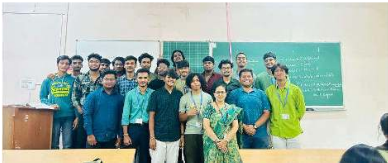
Photo 12.II BCA 'B' SECTION BOYS