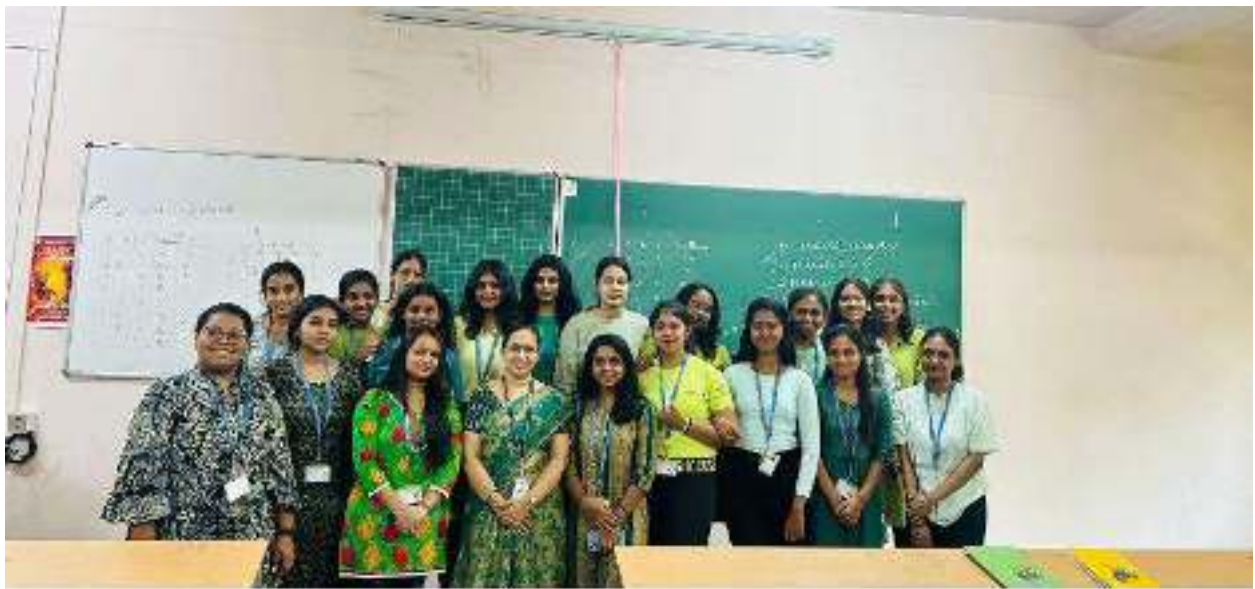
Photo 10 II BCA 'B' SECTION