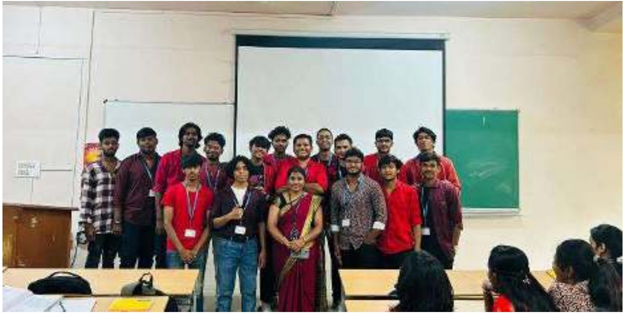
Photo-18.II BCA 'B' section boys