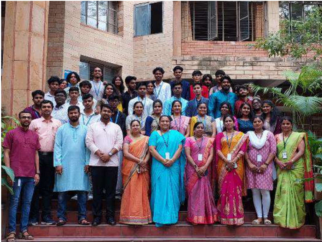
Photo-22.IV BCA'B' Section