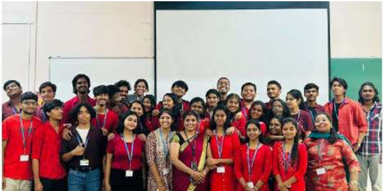
Photo-19.II BCA 'B' section all students