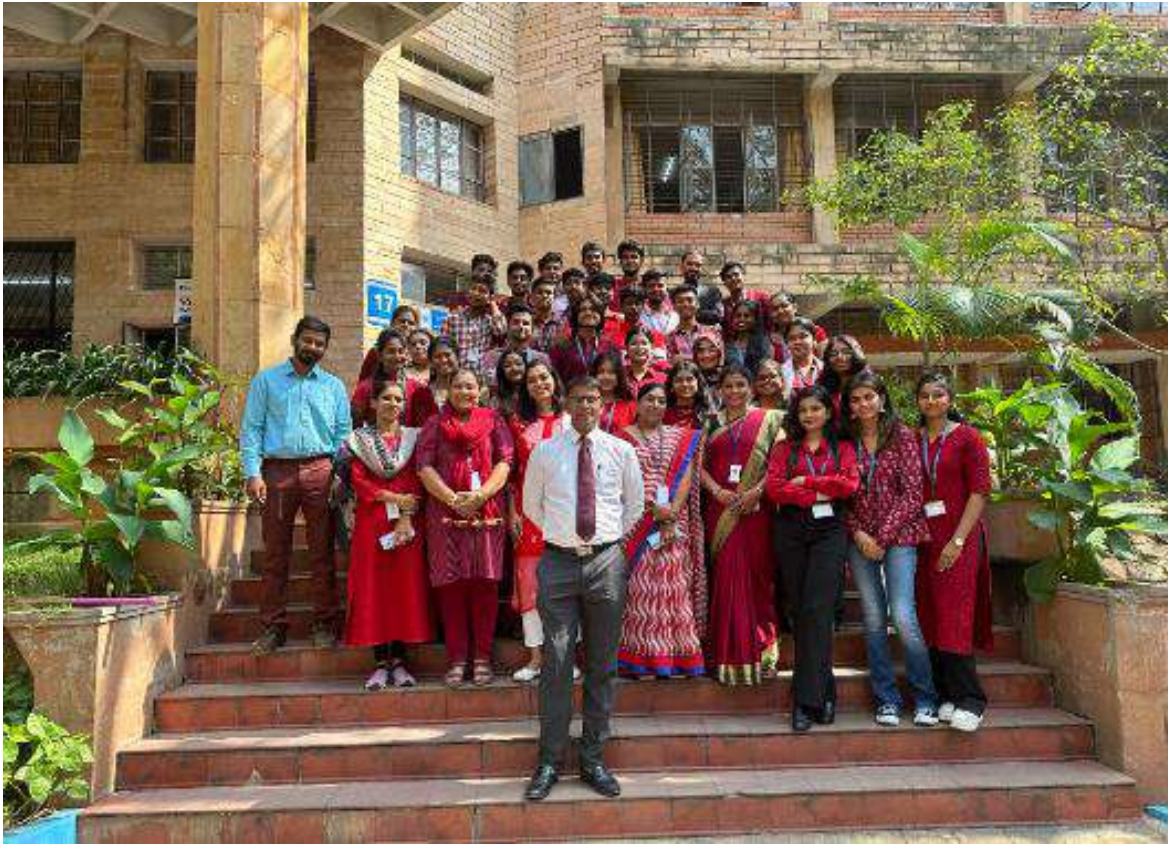
Photo-20.IV BCA 'B' section