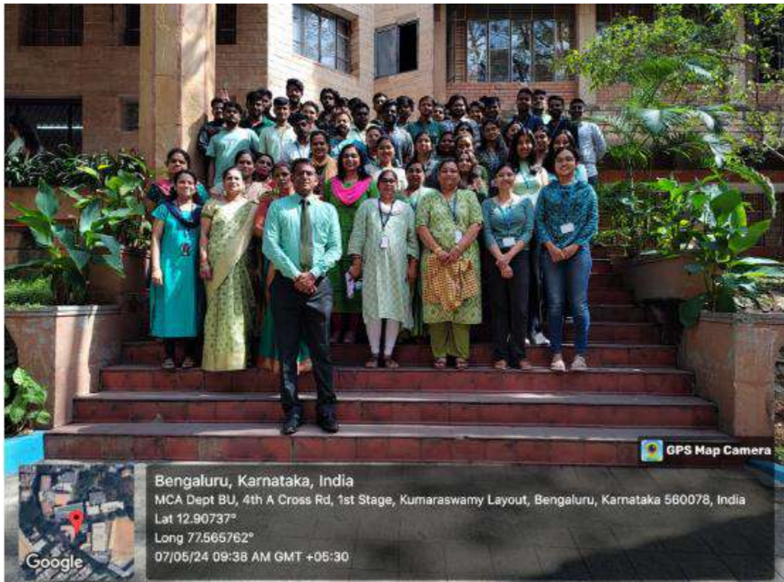
Photo 6.Group Photo