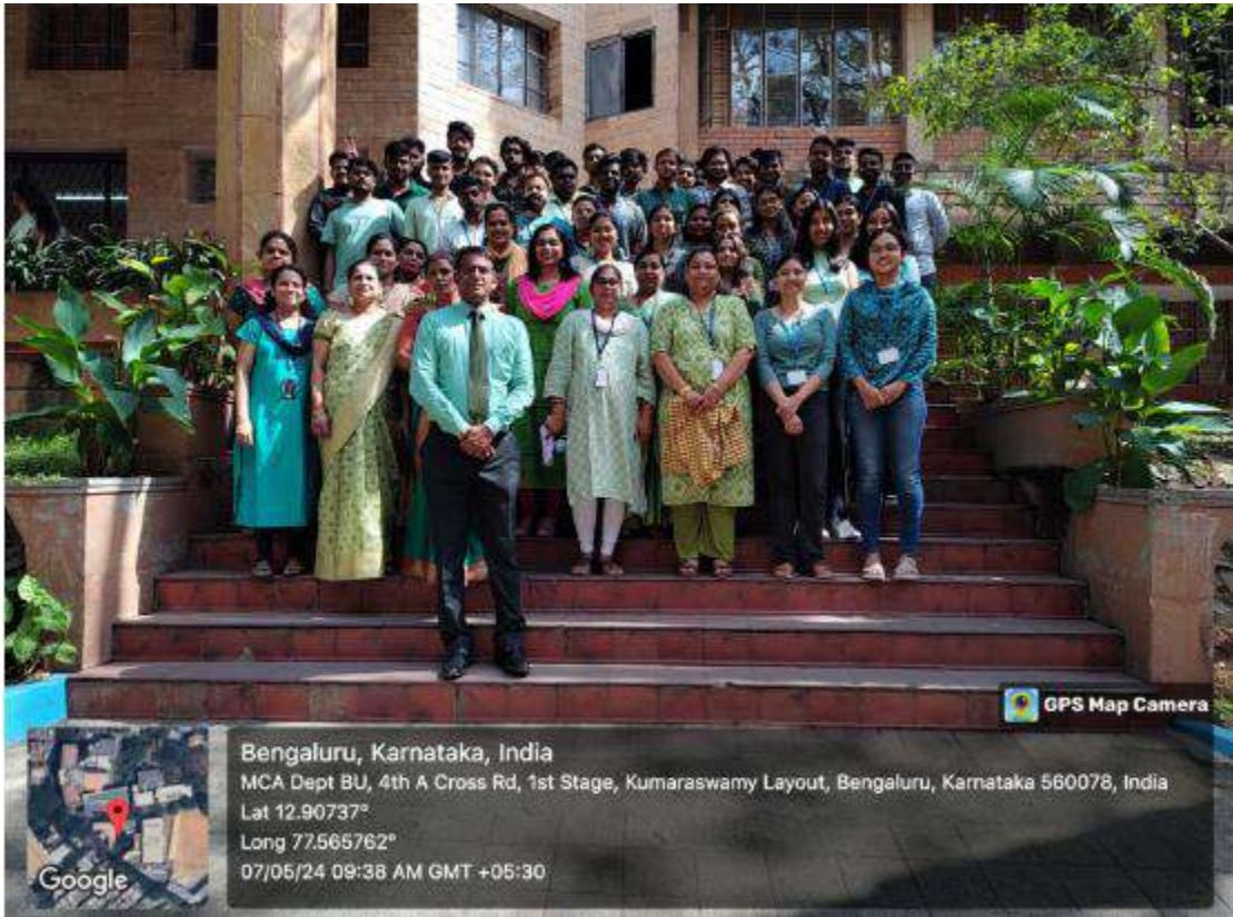
Photo 7.Group Photo