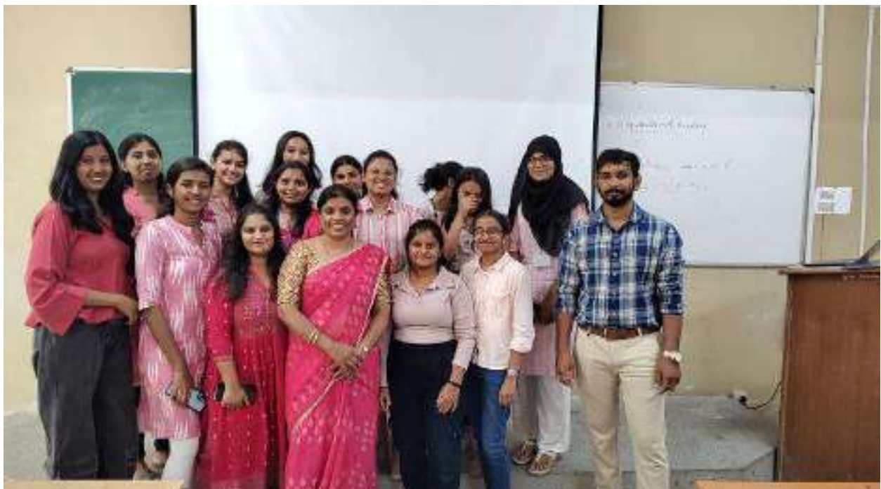
PHOTO 4 VI BCA'A' SECTION