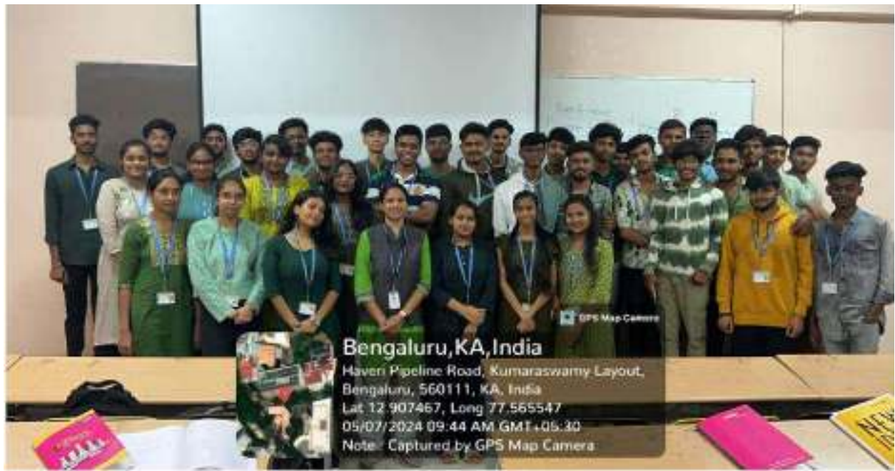
Photo 11.II BCA 'A' section