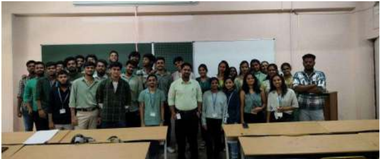
Photo 8 IV BCA 'A' SECTION