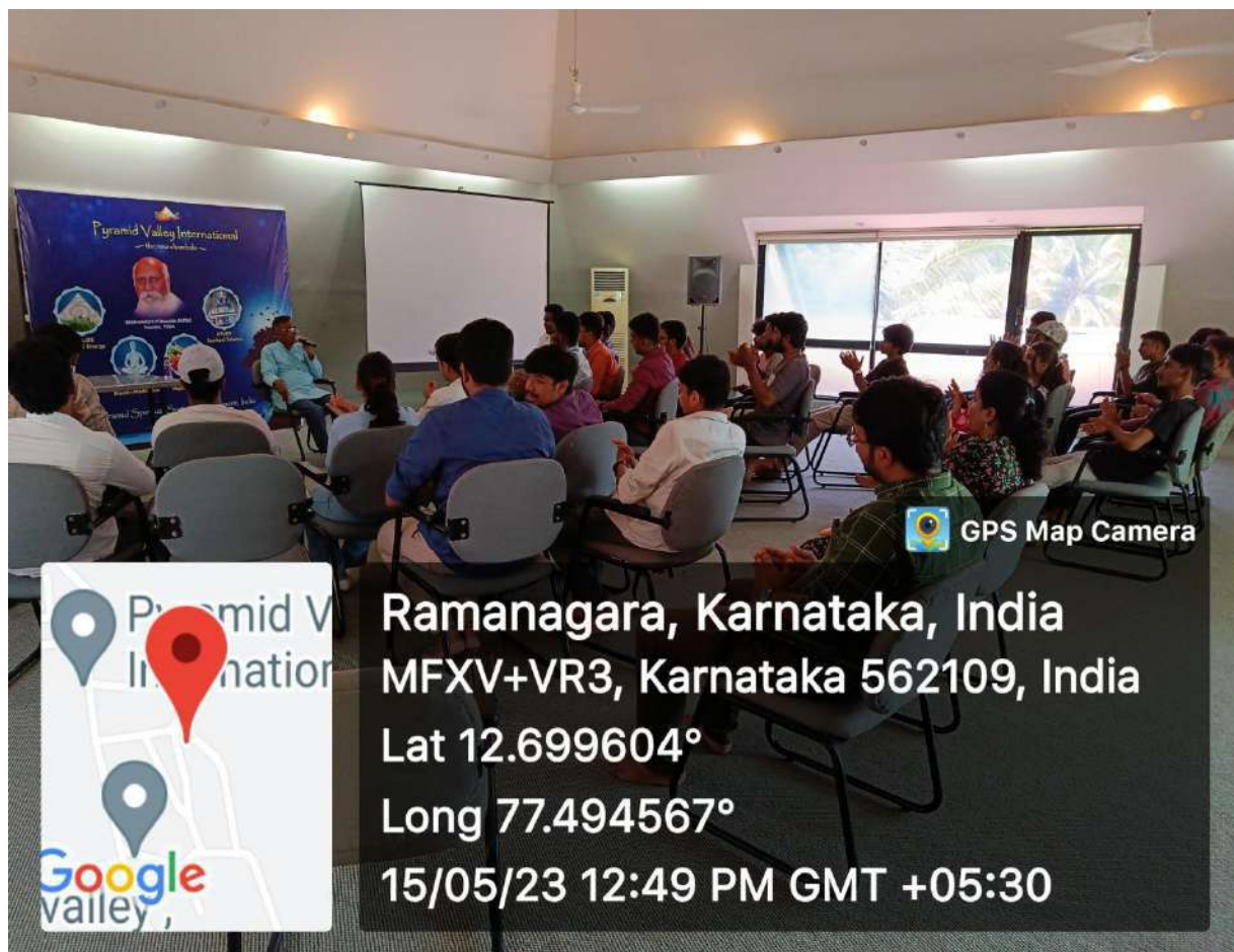
Photo- 4 students attending a session on Meditation at Pyramid Valley.