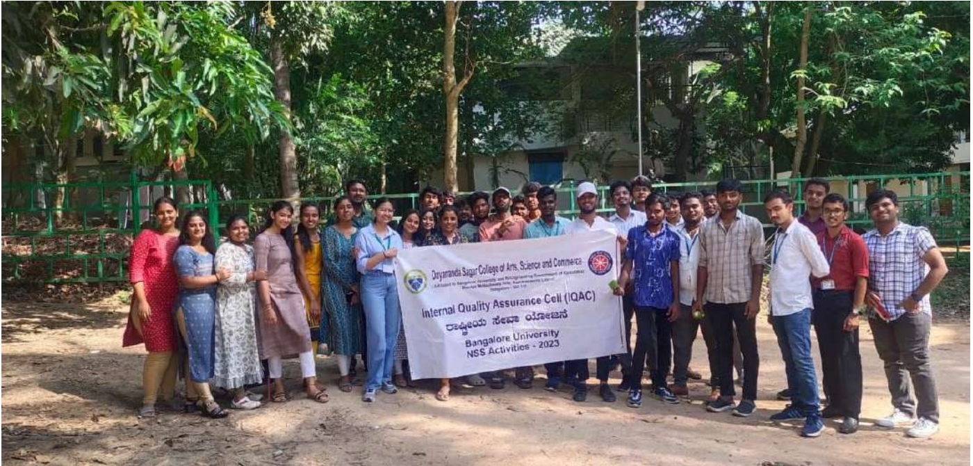
Photo-1 Students and Faculty participants