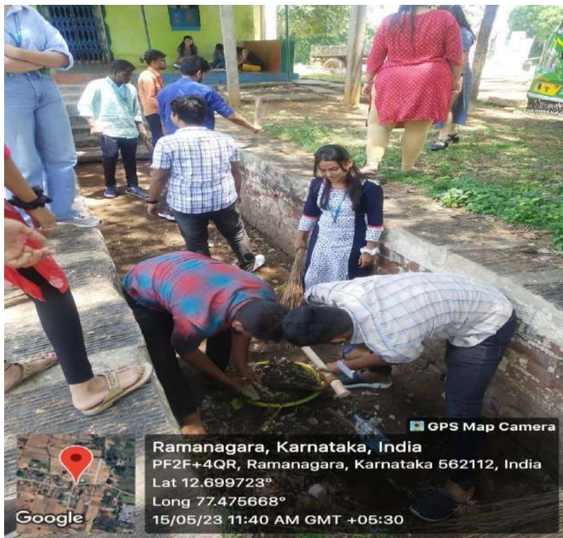
Photo – 3 cleaning activity