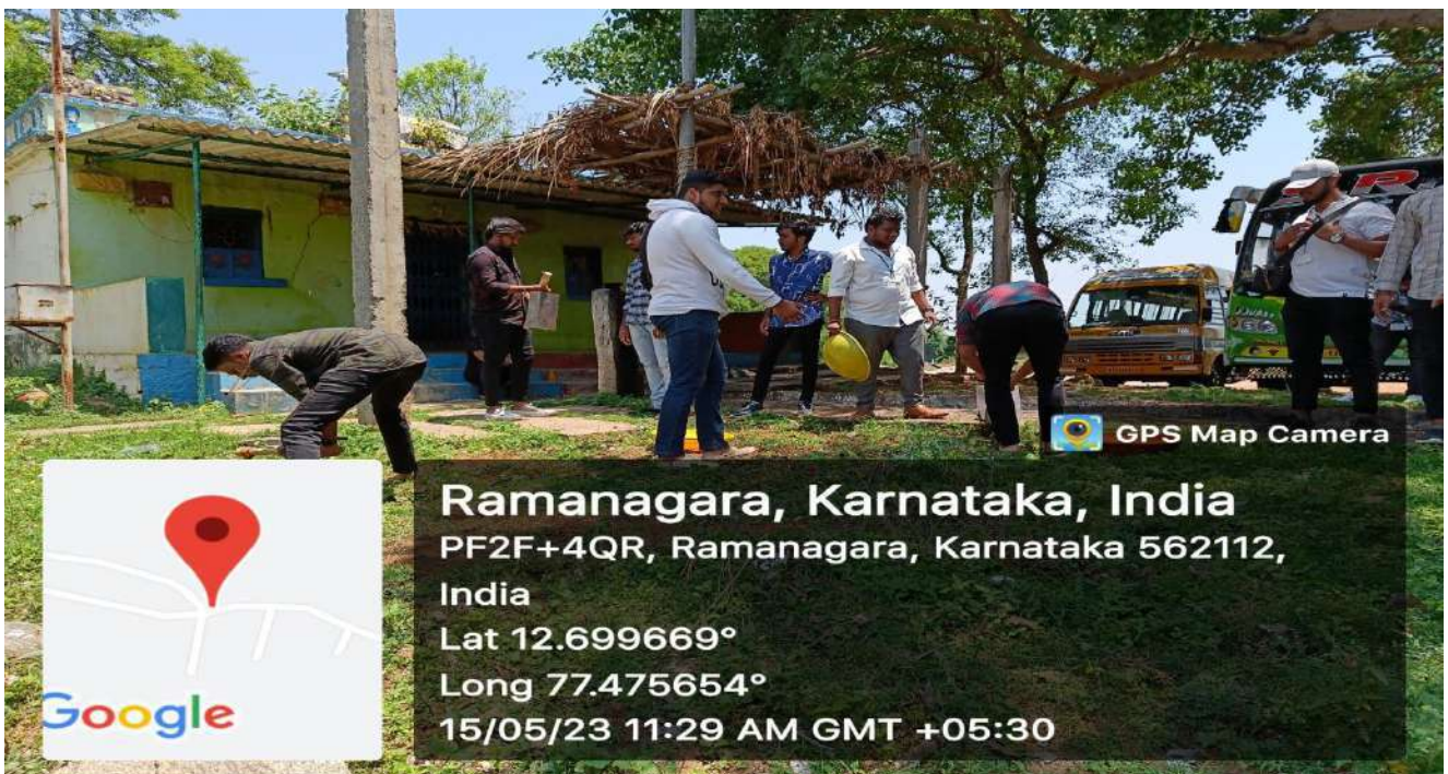
Photo-2 Students during the cleaning activities