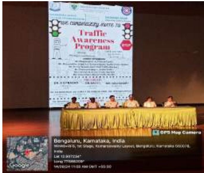
Photo 3- Dignitary on the Dias