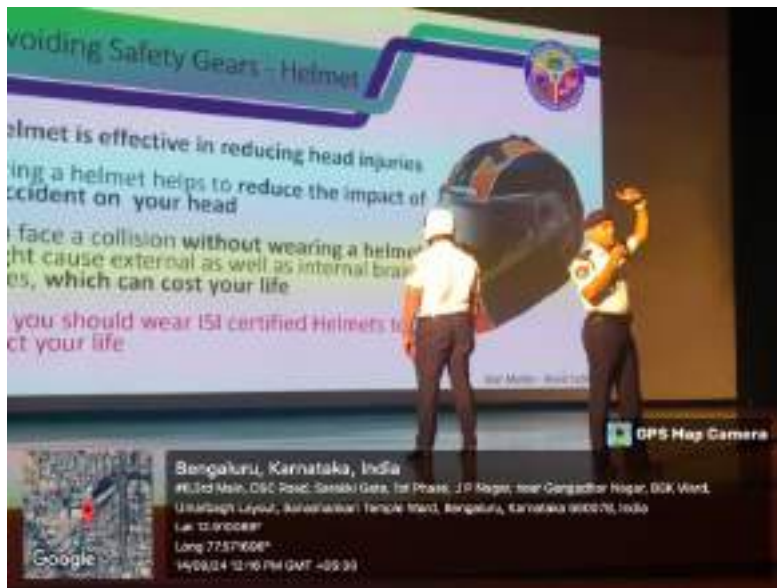
Photo 1- Demonstration of helmet