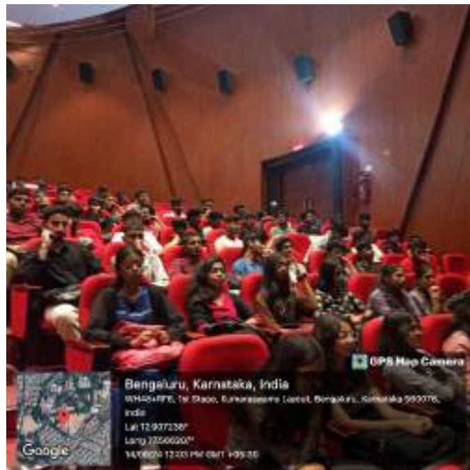
Photo 4- Student Participation