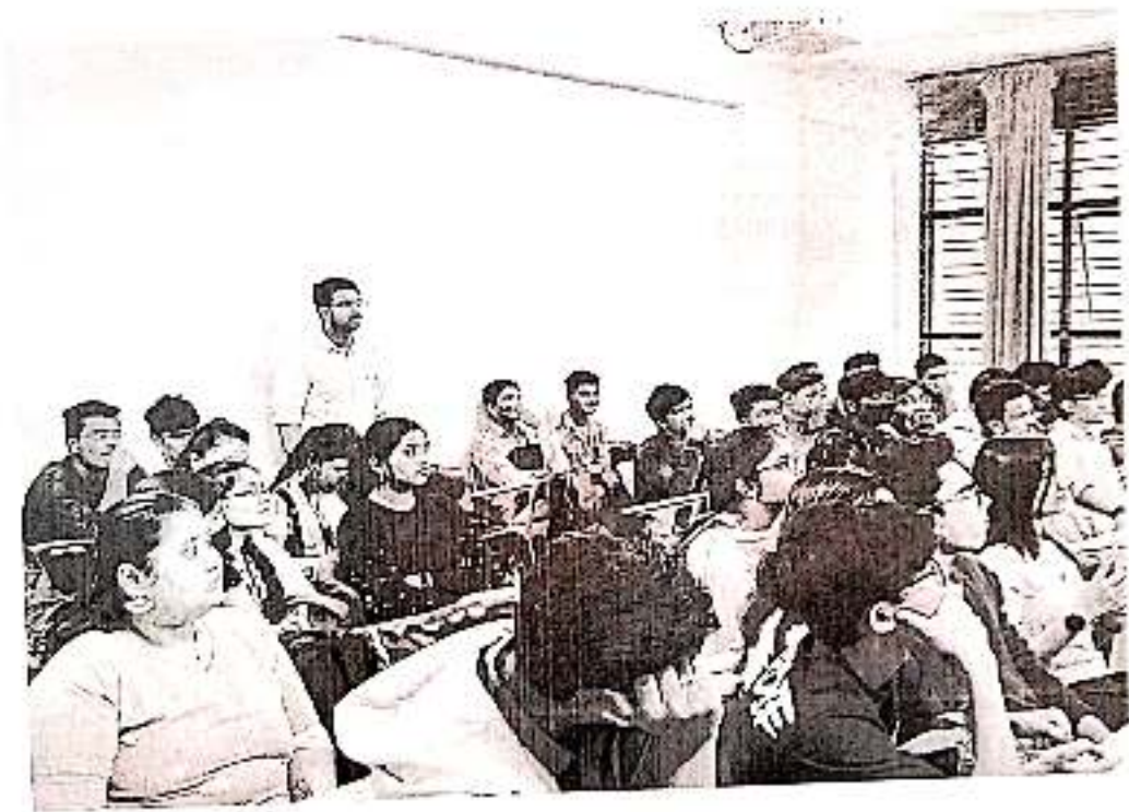
Photo 4- Student Participants