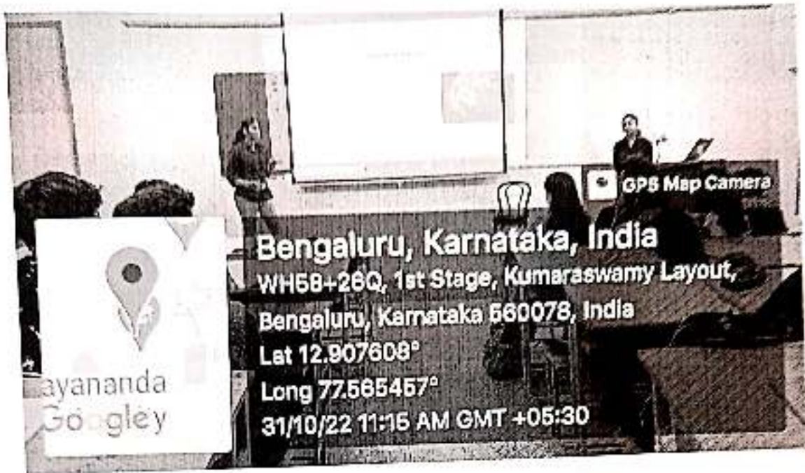
Photo 3- Critical discussions on the short story