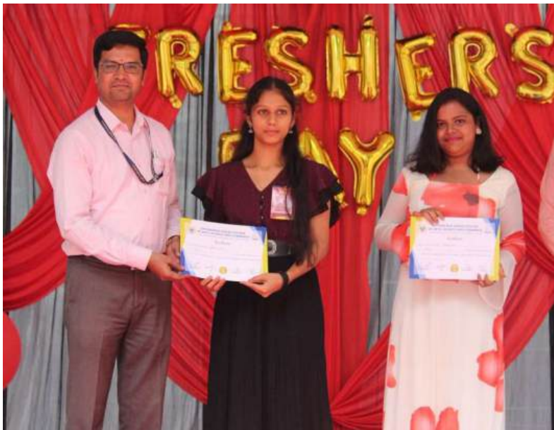
Pic 4: Prize Distribution