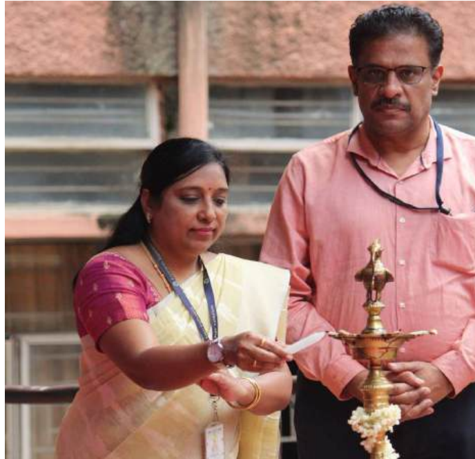
Pic 1: Starting the event with auspicious lamp lighting ceremony