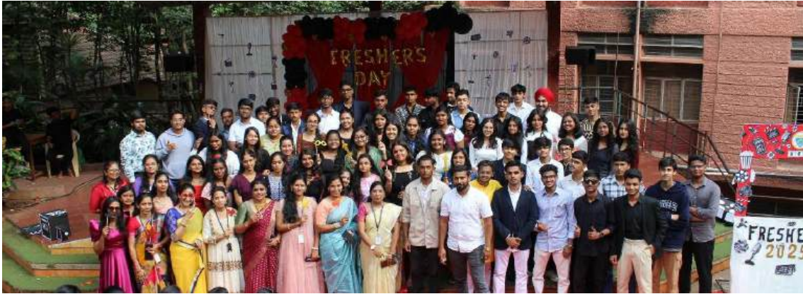
Pic 5: Group Photo