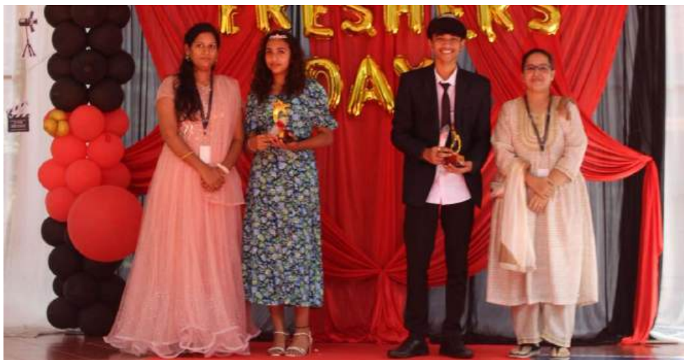
Pic 6: Awarding Mr and Ms Freshie