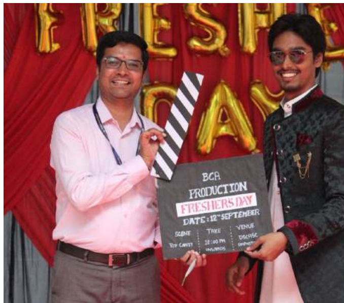
Pic 2: Starting Red Carpet event with Action Clamp