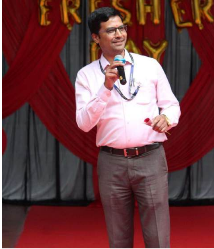
Pic 3: Speech by principal