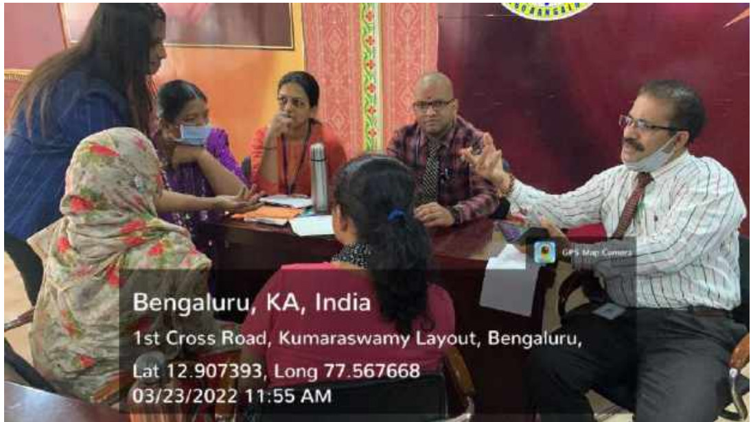
Pic 4: Day1 Group activity Group 2 participants