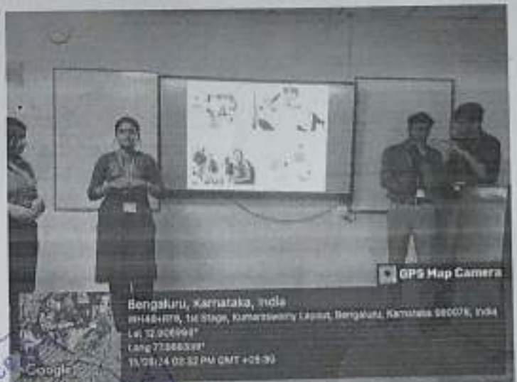
Participants eagerly engaged in the 'Creativity and Mind-Mapping' activity, showcasing their teamwork, creativity, and quick thinking.