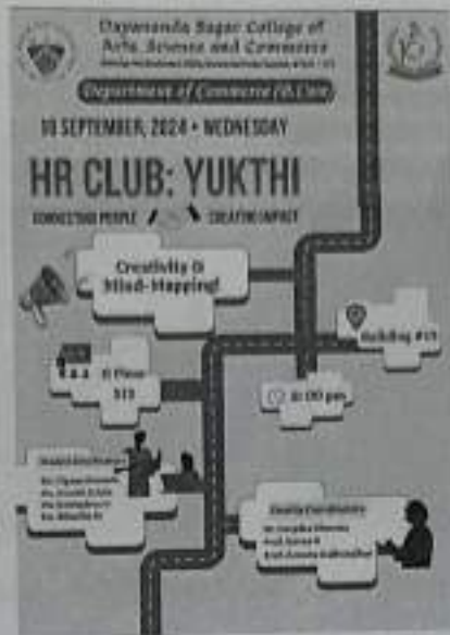
Poster for our exciting event 'Creativity and Mind-Mapping' organised by The HR Club Yukthi.