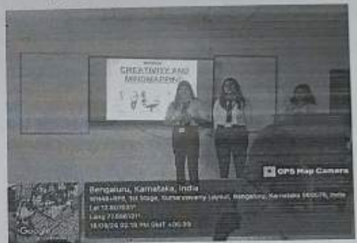
Student coordinators and the faculty coordinator explained the guidelines and rules for the 'Creativity and Mind-Mapping' activity. Teams are briefed on the event's structure, duration, and expectations.