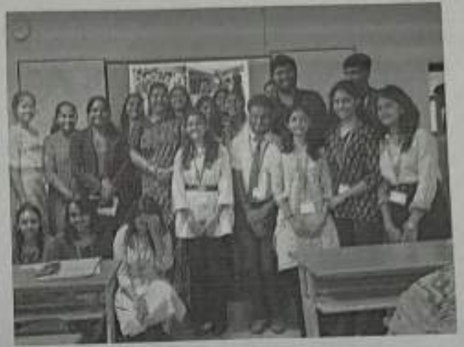
Group photo of participants and coordinators after the 'Creativity and Mind-Mapping' event.