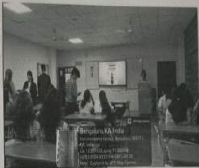
Student Coordinator briefing the participants about the activity.