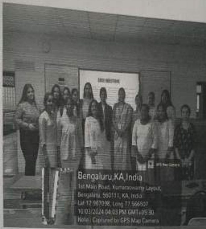
HR Faculty Coordinators with Participants and Student Coordinators.