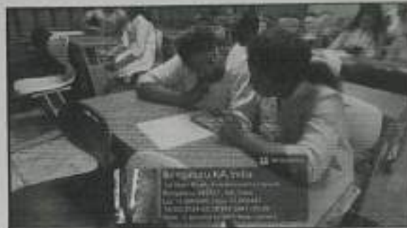
Students actively engaged in solving the case.