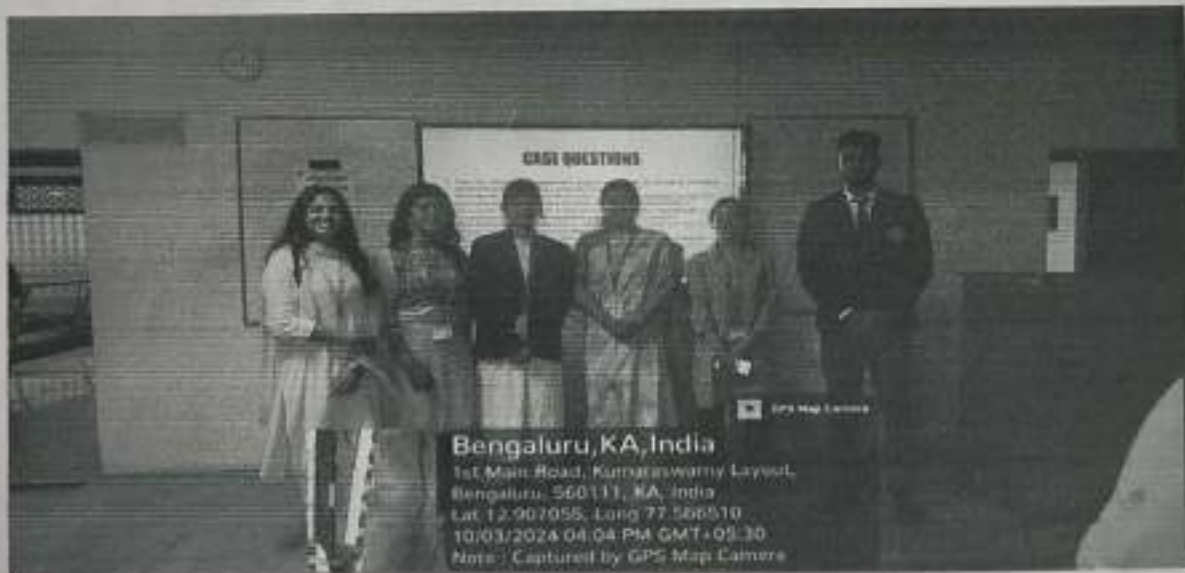
HR Club Student Coordinators