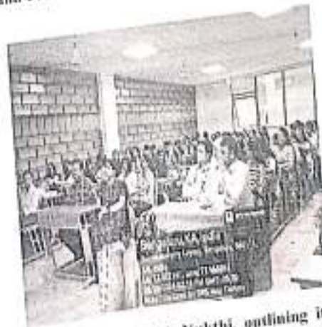
The student coordinator addressing the audience about HR Club Yukthi, outlining its objectives and sharing the plan of action (POA).