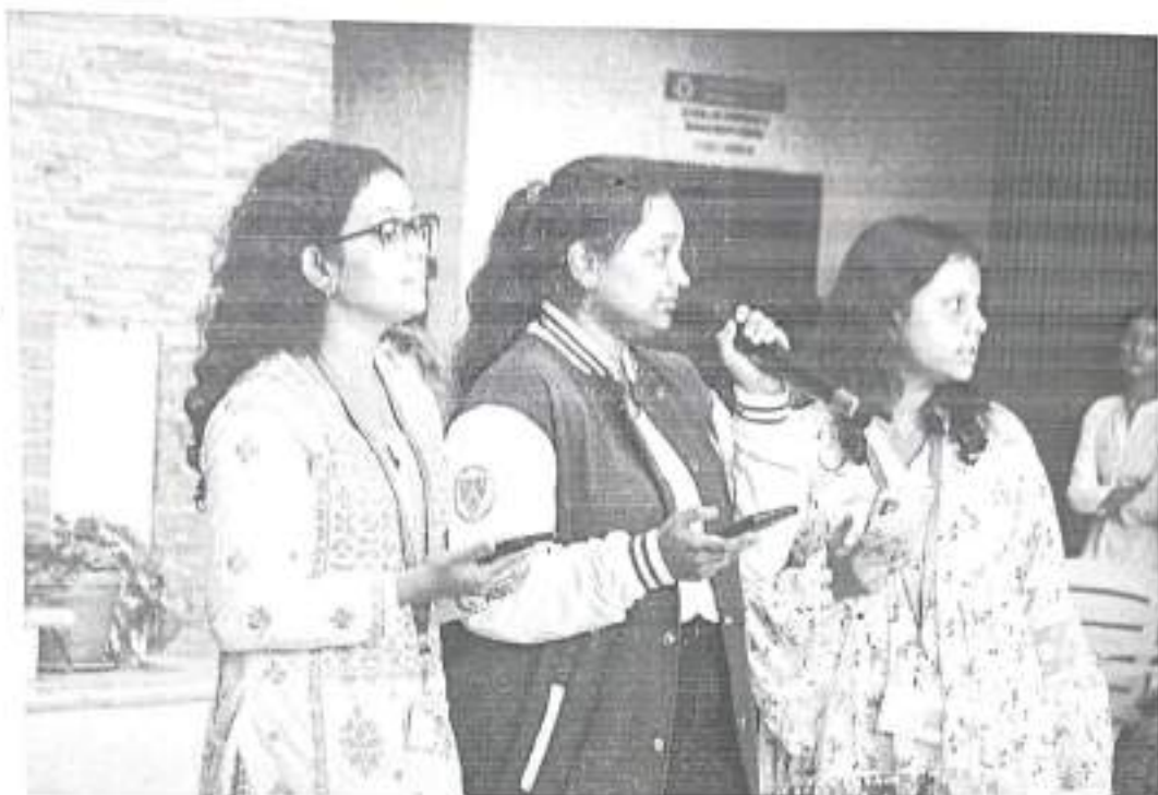
Student singing the song