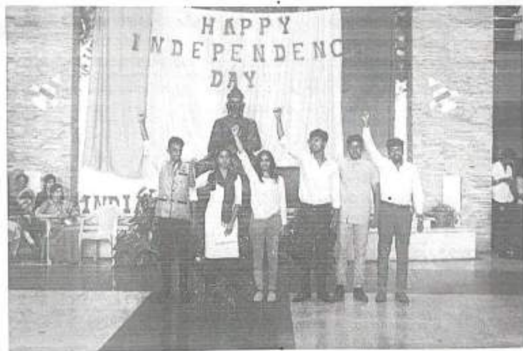
Skit performance by students