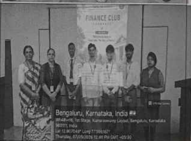
Bengaluru, Karnataka, India 🇮🇳 W:48°7'10, 1st Stage, Kumaraswamy Layout, Bengaluru, Karnataka 560111, India Lat: 12.907548° Long: 77.586167° Thursday, 07/05/2026 12:48 PM GMT +05:30