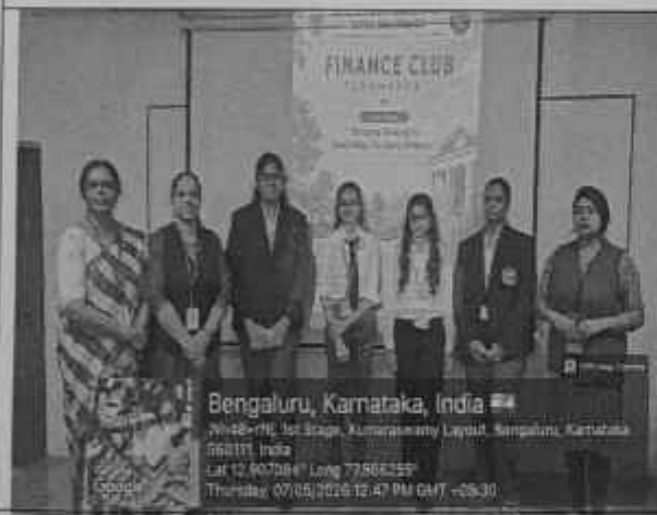
Bengaluru, Karnataka, India 🇮🇳 W:48°7'10, 1st Stage, Kumaraswamy Layout, Bengaluru, Karnataka 560111, India Lat: 12.907588° Long: 77.586255° Thursday, 07/05/2026 12:47 PM GMT +05:30