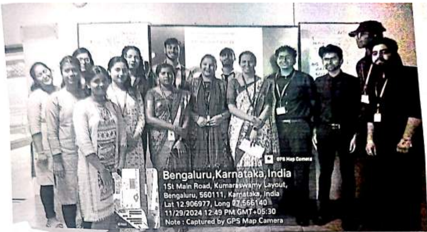
Pic 1- Faculty organizers and Student along with Guest Speaker