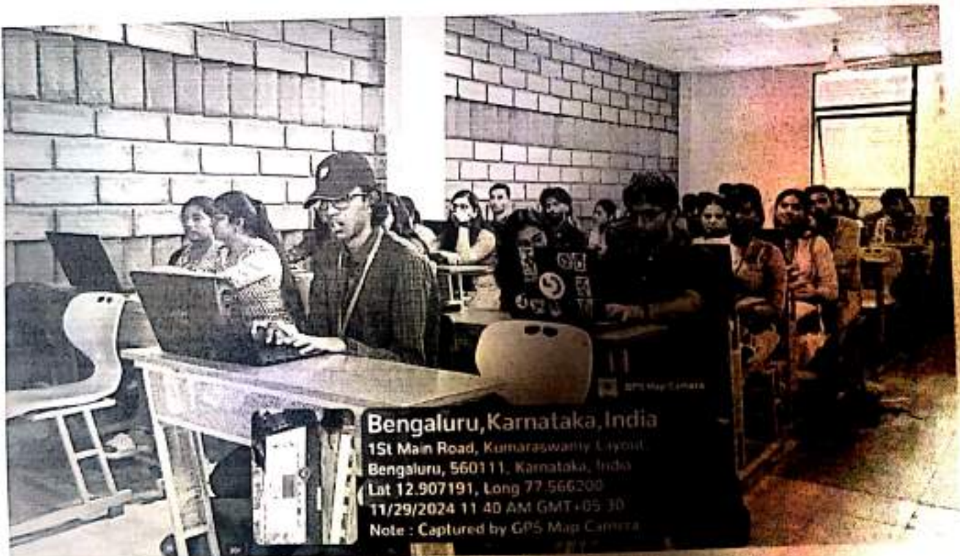
Pic 4: students involved in MS Excel workshop training