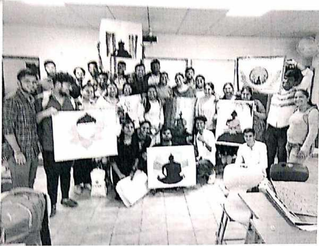
Photo 3: Students' group photograph post completion of the Painting Event